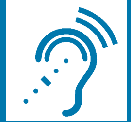
ASSISTIVE LISTENING DEVICES

Would you like help with access to our services? Please let us know!