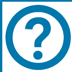
INFORMATION AND HELP