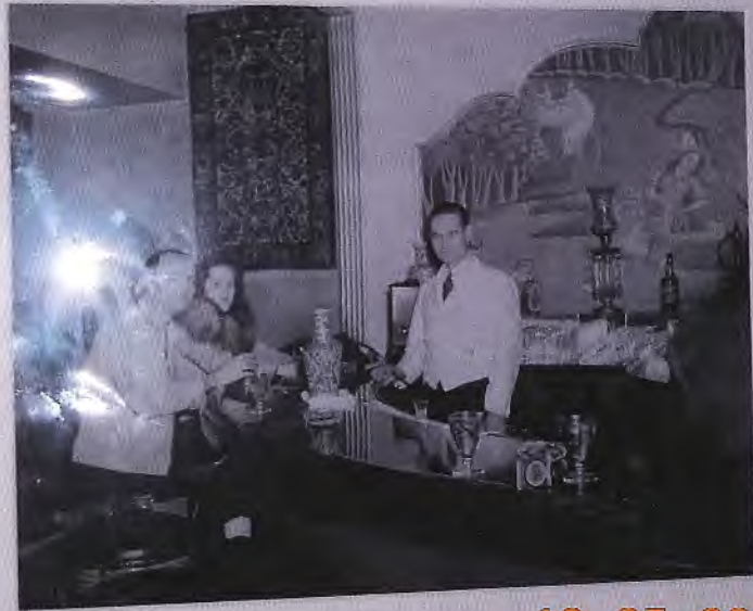
LUCKY STRIKE GREEN Circa 1944