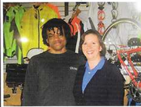
Ocean Cyclery, 1935 Ocean Ave (415) 239-5004