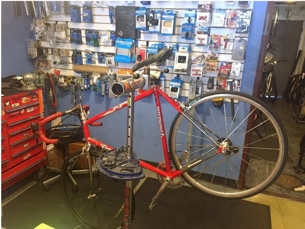
A Tommasini bike being built up at Ocean Cyclery.