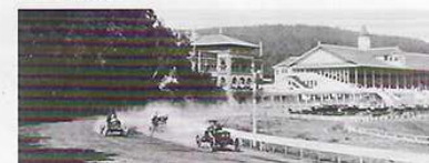
Ingleside Race Track in 1900