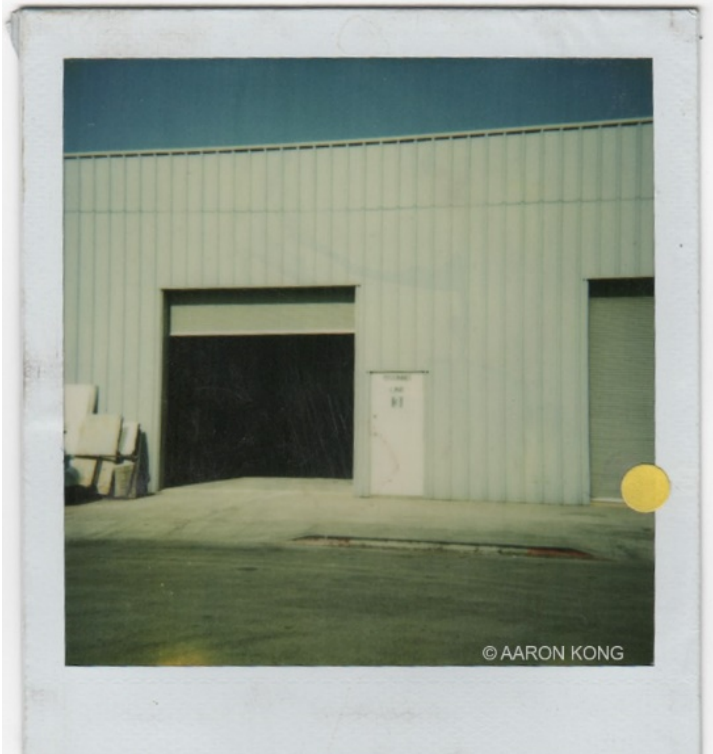
Exterior photo of Tin Wah Noodle Co., 1994.