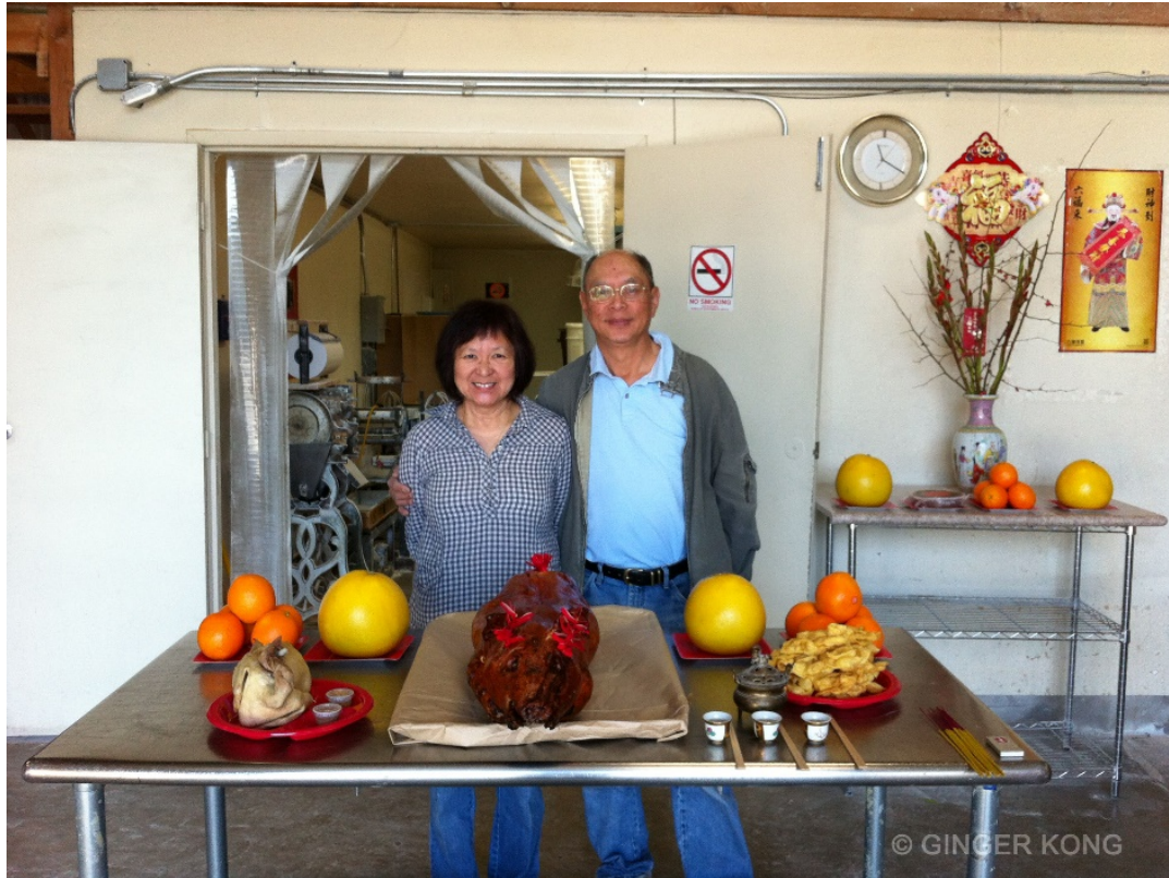
Three generations of noodle-makers