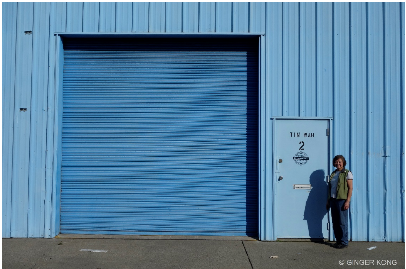
Current exterior photo of Tin Wah Noodle Co., Dec. 2018