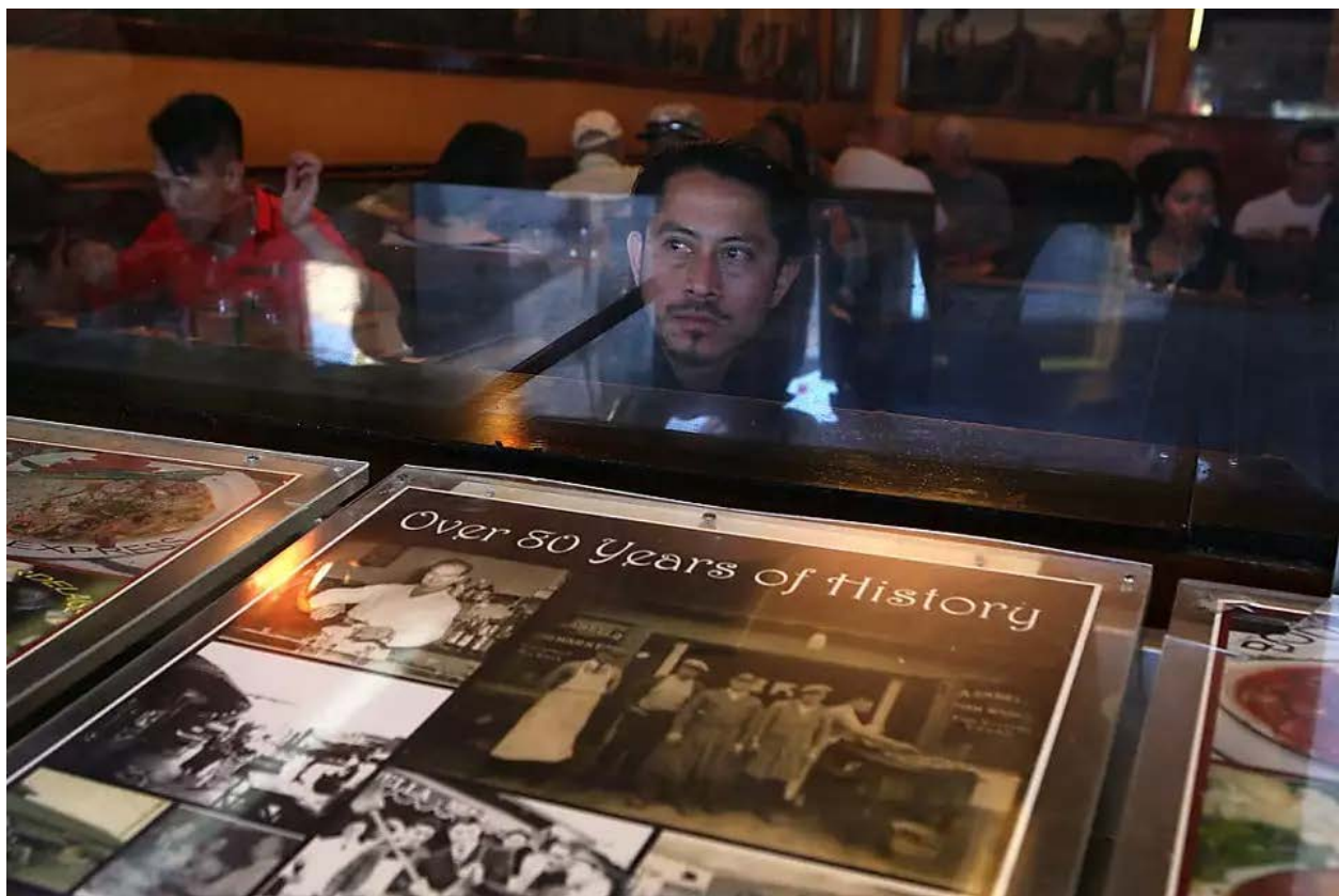
Sabella and La Torre opened in 1927 and was one of the first Fisherman's Wharf restaurants in San Francisco, California, as a covered display of family photos are seen in front of the restaurant on Wednesday, September 4, 2013.

Sabella & La Torre, one of Fisherman's Wharf's original occupants, now spans two outdoor crab stands, a full-service restaurant and bar, and even a crab-shipping business.