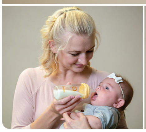
Tip 3: Brush the bottle nipple across your baby's upper lip. Wait for baby's mouth to open.