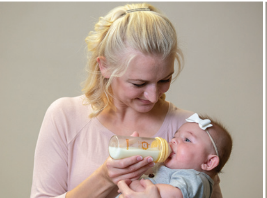
Tip 4: Hold the bottle in an almost flat position. This position keeps the formula or pumped milk from pouring into your baby's mouth. The nipple will fill and your baby will suck on the bottle.