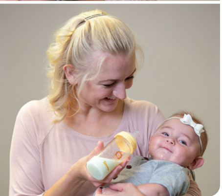
Tip 5: Let your baby pause and take breaks every few sucks. Your baby may feed for about 15–20 minutes.