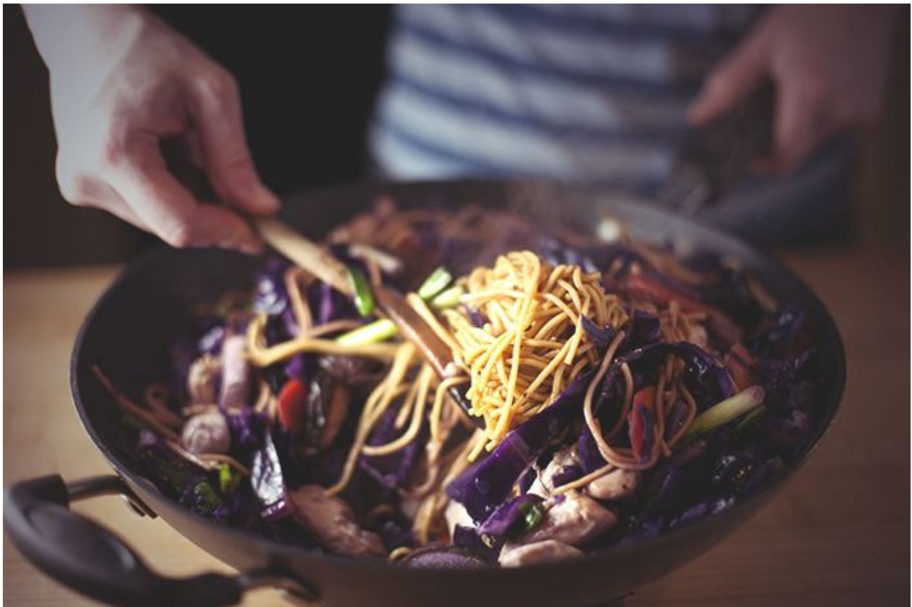
Cooking with a wok.