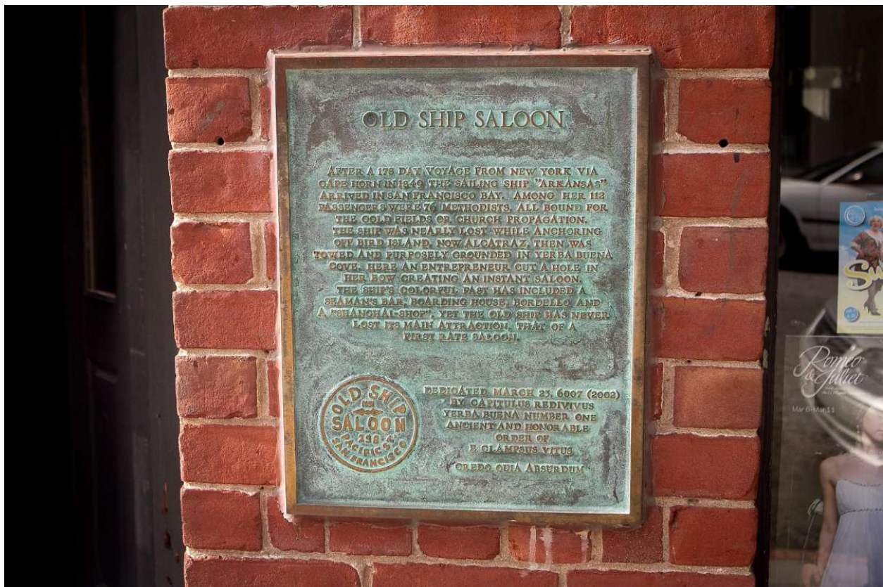
The historic sign outside of the Old Ship Saloon in San Francisco, Calif., is seen on Monday April 2nd, 2012.