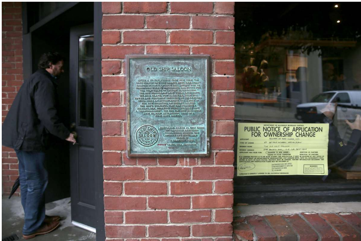
One of the city's oldest bars, Old Ship Saloon, has a plaque outside near the entrance on Wednesday, February 8, 2017, in San Francisco, Calif.