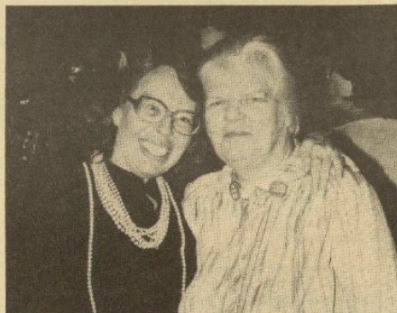
Phyllis Lyon and Del Martin