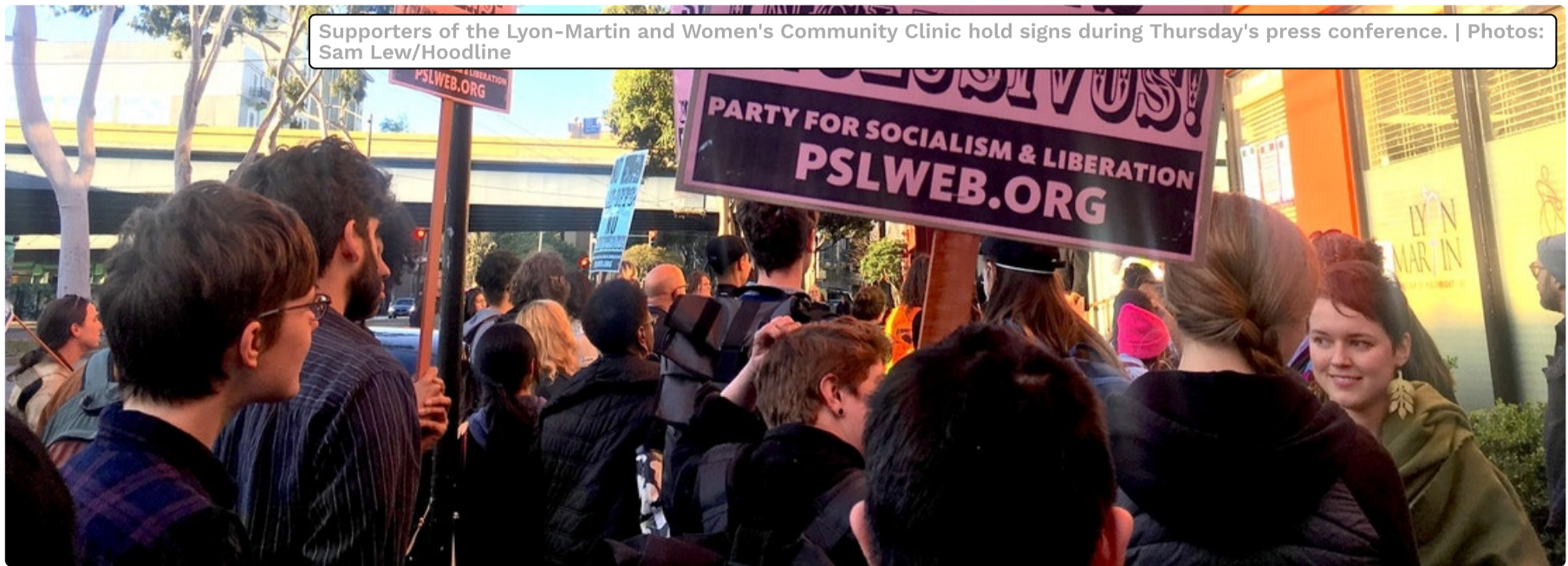
Supporters of the Lyon-Martin and Women's Community Clinic hold signs during Thursday's press conference.