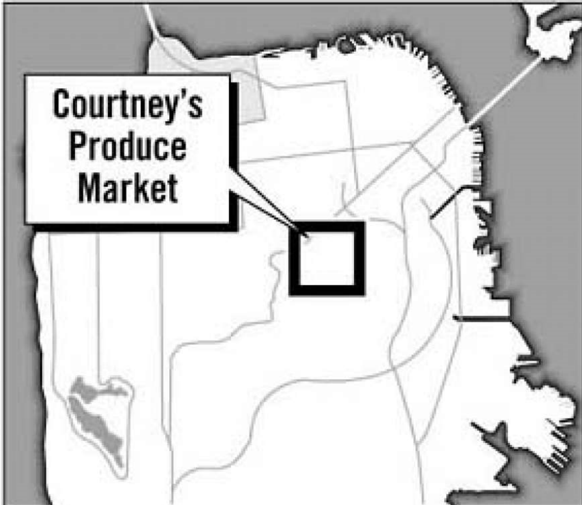
Forty-Nine Stories: No. 30. Chronicle Graphic

"It's a total family thing," Cerone says. "I know 90 percent of the customers. This is one of the last true mom-and-pop stores."