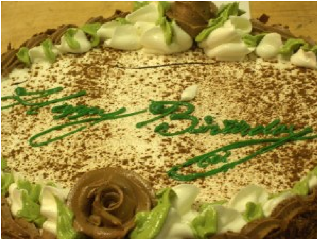
Loyal customers choose Dianda's cakes for their parties.