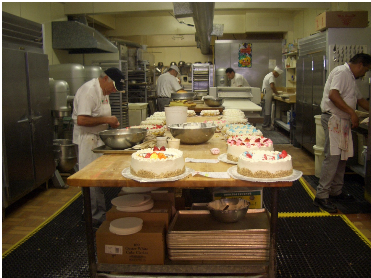
Bakers begin work at 2 a.m.