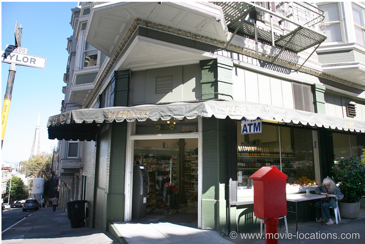
Bullitt location: Bullitt stocks up on TV dinners: VJ Groceries, Clay Street, San Francisco

It's downhill for Ross from here: the rather less grand 'Daniels Hotel' in which he's installed for his safety stood on Embarcadero , at Howard Street opposite Pier 18 beneath the foot of the double-deck Oakland Bay Bridge . The whole area has since been massively redeveloped and both the hotel and pier are gone.