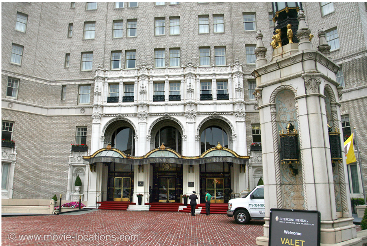
Bullitt location: Ross is spotted in the hotel lobby: Mark Hopkins Hotel, 1 Nob Hill, San Francisco

Detective Frank Bullitt ( Steve McQueen ) has to track down a hit squad before the fact leaks out that their target, prize witness Johnnie Ross, has already been offed.