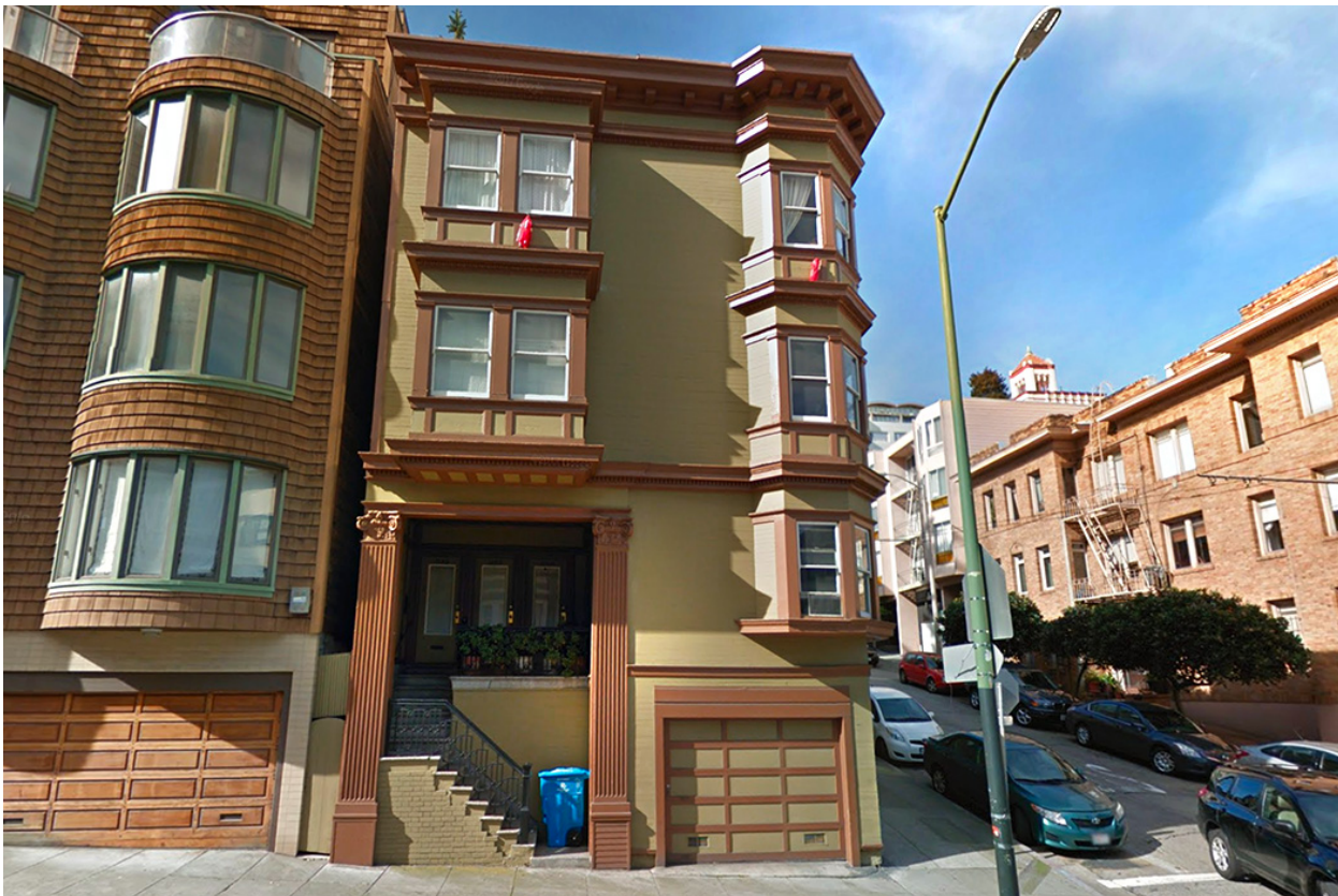
Bullitt location: Frank Bullitt's apartment: Taylor Street, San Francisco