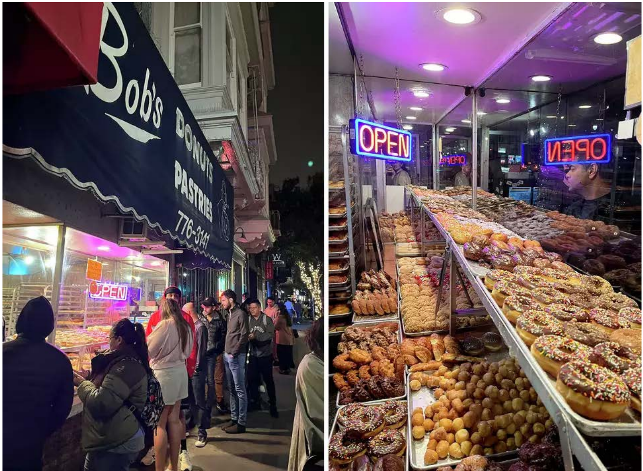
Bob's Donuts is a late night staple for Polk Street bargoers.

This time of night, folks lined up down the block for a sugar rush. Despite the alcohol in my system, I restrained myself and ordered only one: that beautiful s'mores doughnut that had called to me from the window. My pals and I congregated on the sidewalk beside the other inebriated sweet teeth with our pink boxes, sinking our teeth into the fluffy pastries.