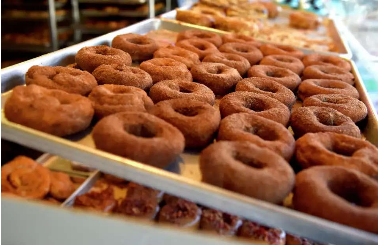
Freshly baked doughnuts call from the window at Bob's Donuts.

I requested a small box of doughnuts, and the helpful person behind the counter guided me through the bakery's most popular (and most delicious) offerings. She filled my pink box with an apple fritter ($3), a crumb doughnut ($1.75), a chocolate with sprinkles ($3.50) and a specialty croissant-doughnut hybrid ($4.50).