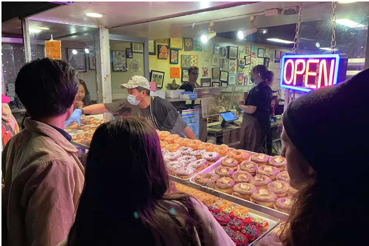
The late night line for Bob's Donuts, on Polk Street in San Francisco, on Friday, July 8, 2022.

Bob's is so ingrained in locals' consciousness, I hesitate to even categorize it as a tourist destination. But it's the sort of place that manages to appeal to pretty much all demographics — 20-something barhoppers in the wee hours and families touring the city in the light of day. Celebrities have even made the essential doughnut pit stop , from Nicolas Cage to Prince .