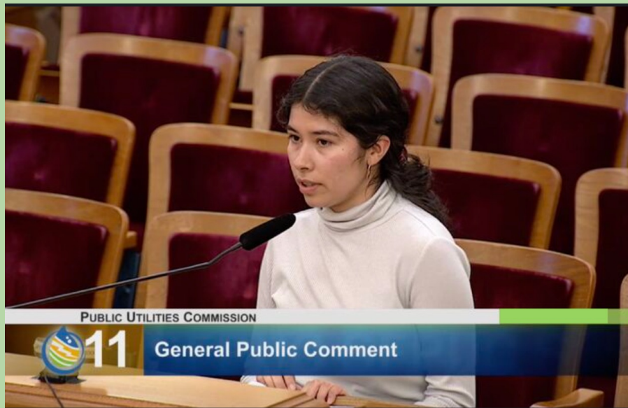
SF P.U.C. Public Testimony