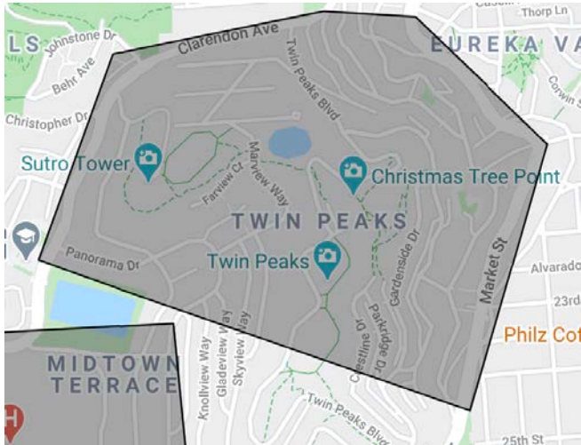
[Image description: The image shows a screenshot of a mapped area around the Twin Peaks Radio Tower site.]