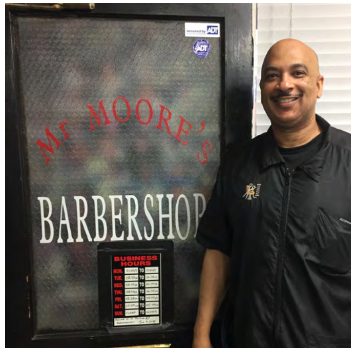
Figure 1. Legacy businesses, such as Moore’s Barbershop in Arlington, Virginia, have sustained a sense of place for generations

While recognizing that legacy business programs cannot alone solve the myriad of challenging economic conditions faced by small businesses, this PAS Memo seeks to broaden planners’ exposure to the concept and encourage them to join forces with preservationists and economic development offi-