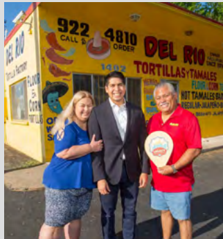
Figure 4. The owners of Del Rio Tortilla Company, a designated San Antonio legacy business, and their city council representative celebrate the city's Preservation Month

The city's World Heritage Office established an important complementary effort for legacy businesses in the vicinity of San Antonio's World Heritage Site, though funds have been suspended during the COVID-19 pandemic. The World Heritage Area Legacy Business Grant Pilot Program recognized that authentic and stable legacy businesses help provide an "inviting cultural experience" to those who visit the city's famed collection of colonial Missions. It has supported designated businesses with matching grants for facade improvements, signage, and landscape improvements; loans for interior improvements; and technical assistance programs (San Antonio World Heritage Office 2018).