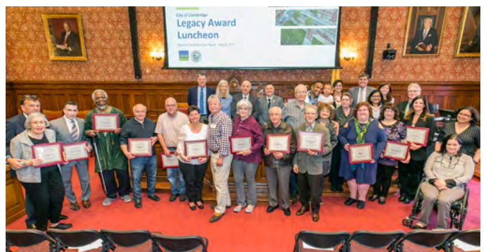
Figure 5. Cambridge Small Business Legacy Luncheon, May 2019

Before launching its program, Seattle staff spent several years studying the needs of small businesses and found that many were skeptical of the legacy business concept; staff heard that "another plaque was not going to solve anything" (Wells 2019). As a result, Seattle worked hard to create products that would be useful; among the benefits of legacy business des-