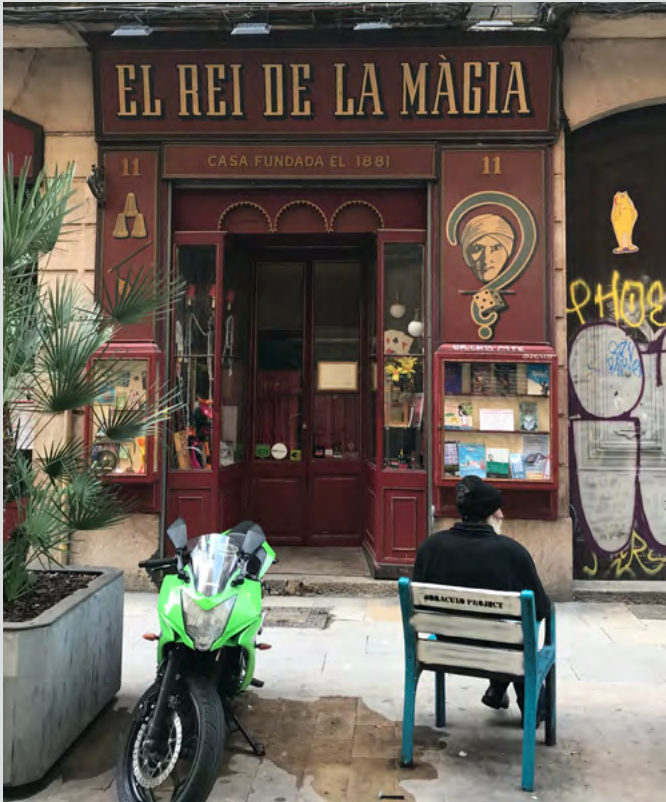
Figure 2. This store, “the oldest magic shop in the world,” is one of Barcelona’s Establishments of Interest (Elizabeth Morton)