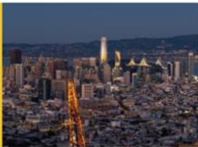
"Downtown SF Blue Hour" by Barbara Day