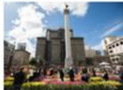
"American Tulip Day in Union Square" by Pawar