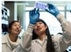
"Life science research in Mission Bay"