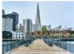
"Pier 7 on the northern waterfront" by Dustin