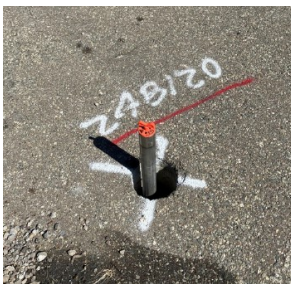
Example of installed porewater sampling well at HPNS