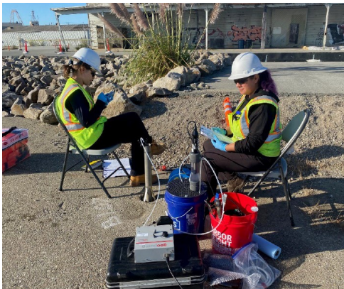
Porewater sampling at Parcel B-2