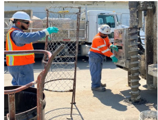
Hollow-stem auger access point into utilidor at Parcel B-2