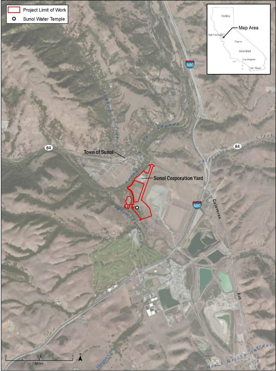
Figure 1 Project Vicinity