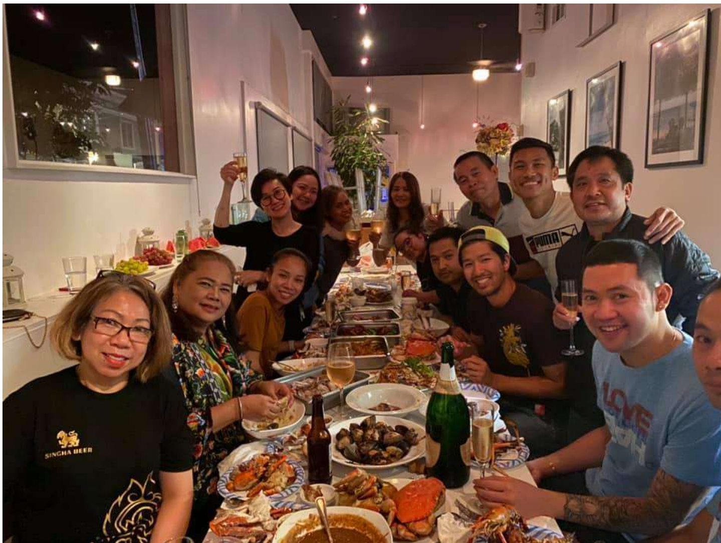
Above: The entire Thai House staff in September 2019