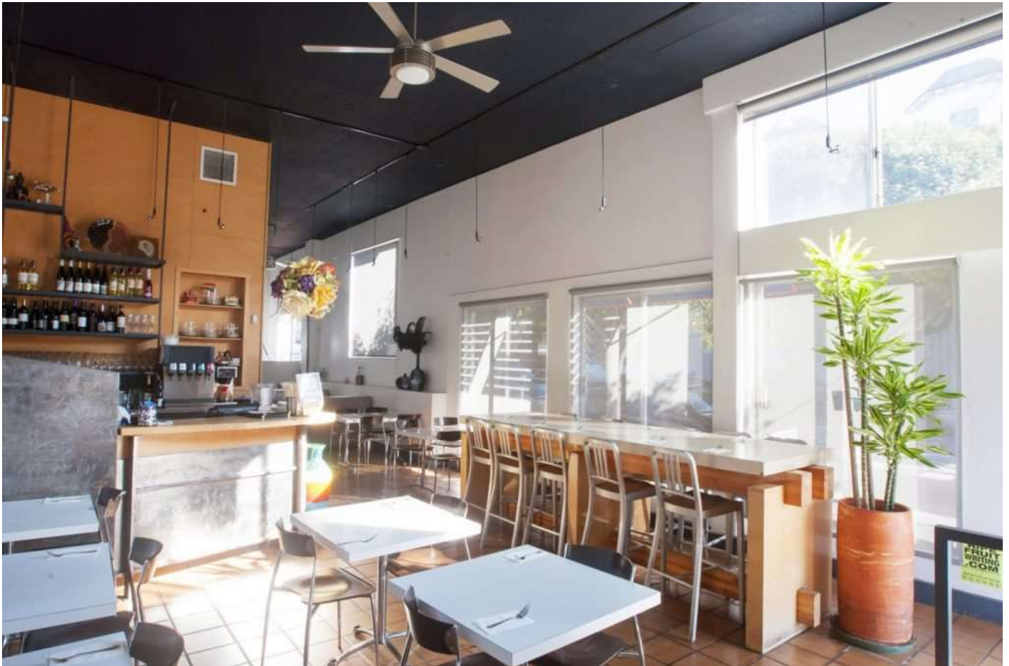
Inside Thai House Express