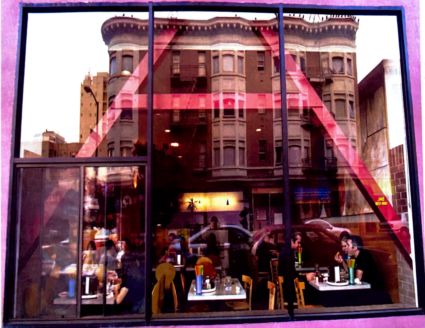
Diners enjoy the unique regional dishes served at Thai House Express.