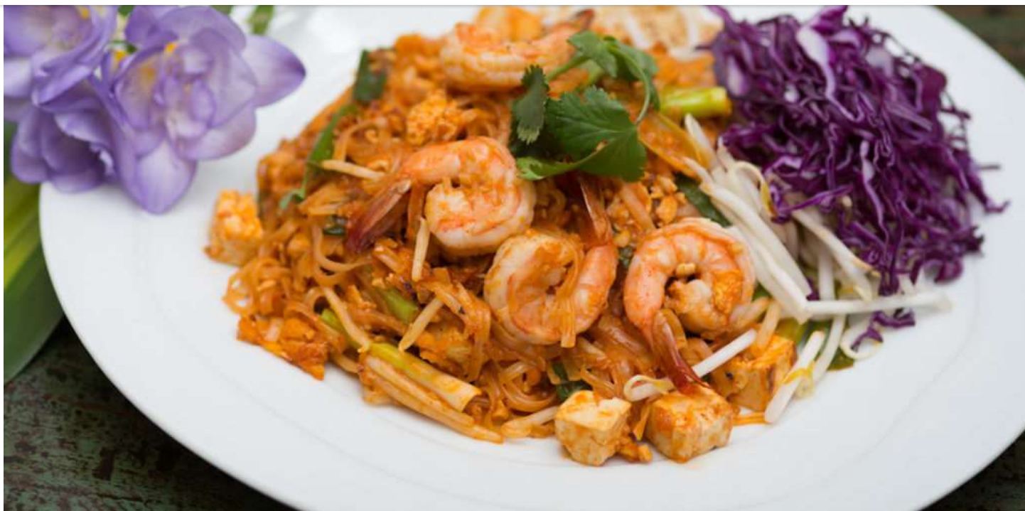
Pad thai shrimp

At the same time, the former Thai Houses resulted in one big menu. Por-Phol shares his goal to minimize their current offerings. “It used to be over 100 things. It’s good to have a smaller menu now,” he states. The ongoing refinement of the food and food choices reflects the Thai House Express crew’s character to a “T.”