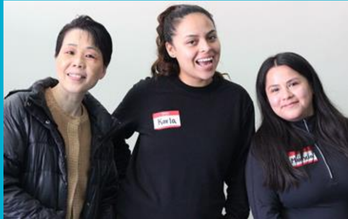
Employment Support Team