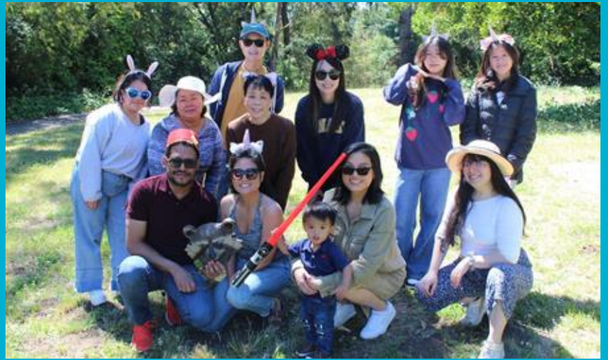
Excelsior Works Summer Picnic