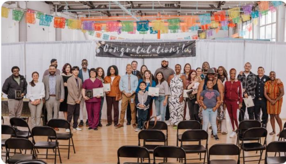
Self-Help for the Elderly 安老自助處 and 9 others

We had the privilege last week of celebrating graduates from our #HealthCareAcademy who are making an immediate impact in San Francisco communities. These grads have already accomplished so much, overcoming obstacles while excelling and embodying the agencies where they trained.