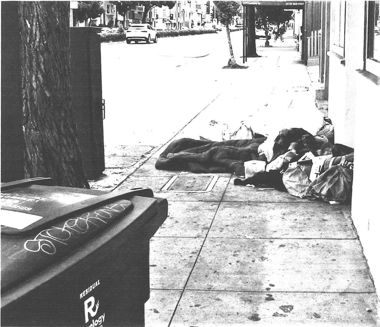
Property trespass and blocked sidewalk at 1799 Lombard St. (HR Block building). Garbage and hazardous materials are present.