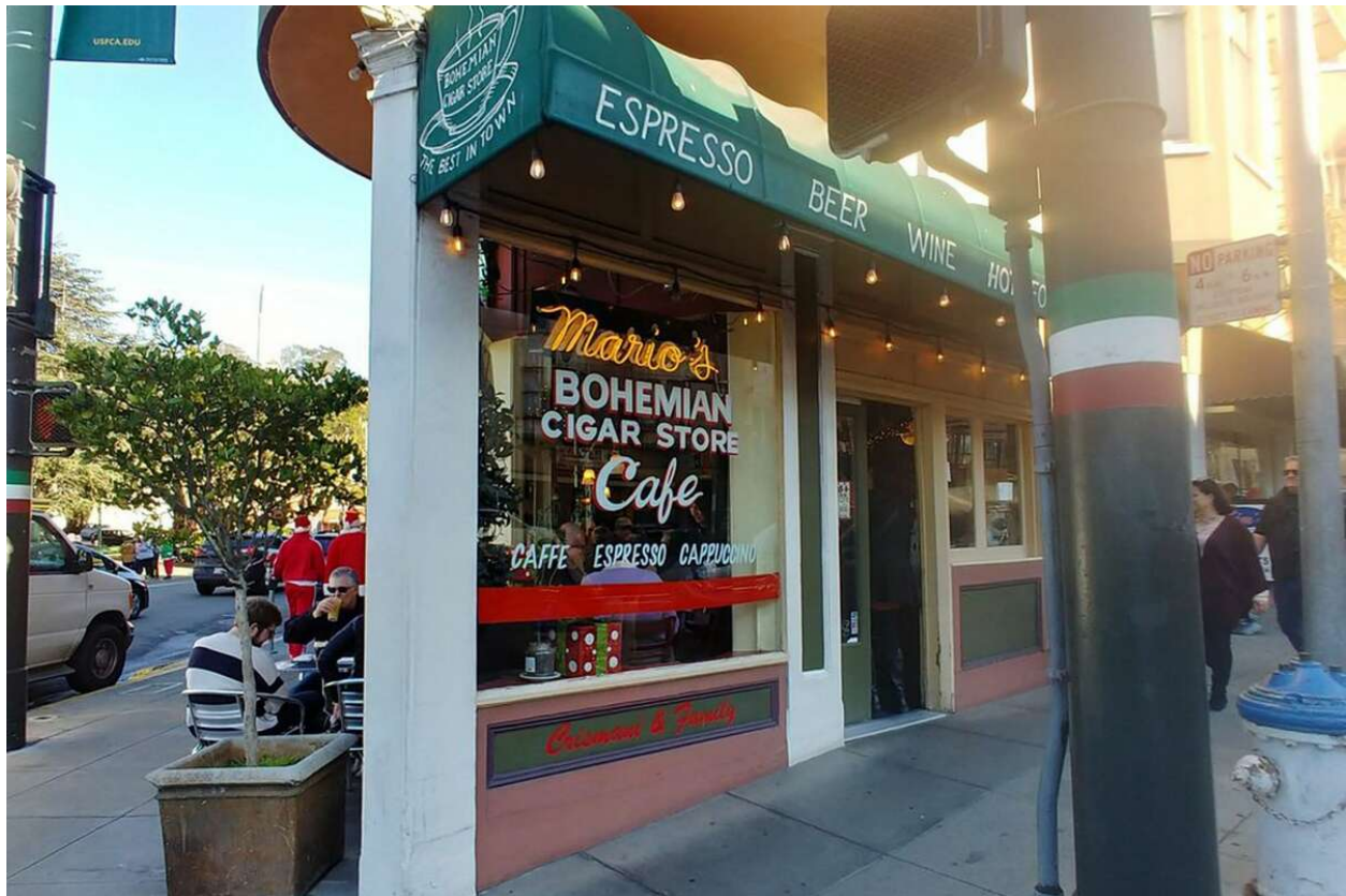
The exterior of Mario's Bohemian Cigar Store Cafe in North Beach.

But Mario's never went out of favor with her. We could always step inside its cozy space with the wood floor, the awkward flatiron shape and the big windows with a view of Washington Square Park. Nothing fancy, just a well-worn, warm spot with — I'll say it again — amazing sandwiches.