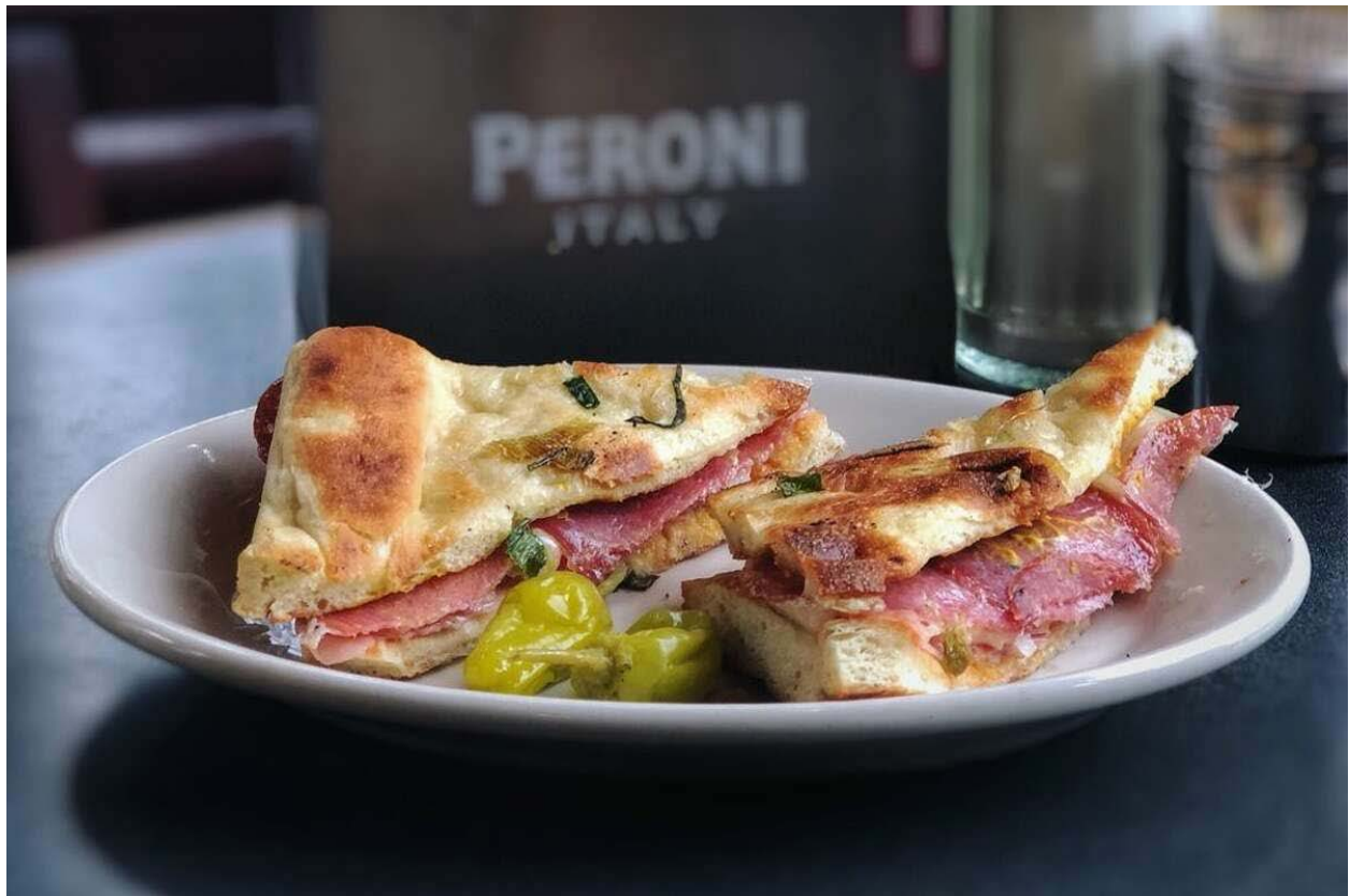
One of the sandwiches available at Mario's Bohemian Cigar Store Cafe in North Beach.