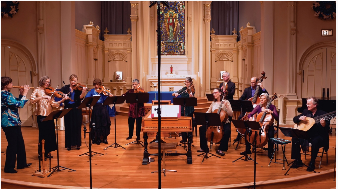
Voices of Music performing music of Michael Praetorius at St. Mark's Lutheran Church.

$26,000 P.O. Box 15576 San Francisco, CA 94115-0576 415.771.3352 www.voltisf.org