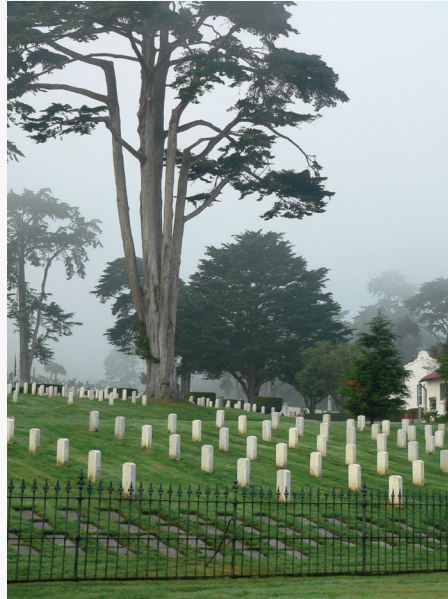
The traditional Memorial Day parade and formal ceremony is held at the Presidio National Cemetery.

War Memorial Veterans Building 401 Van Ness Avenue, Room 101 San Francisco, CA 94102 415.710.5293