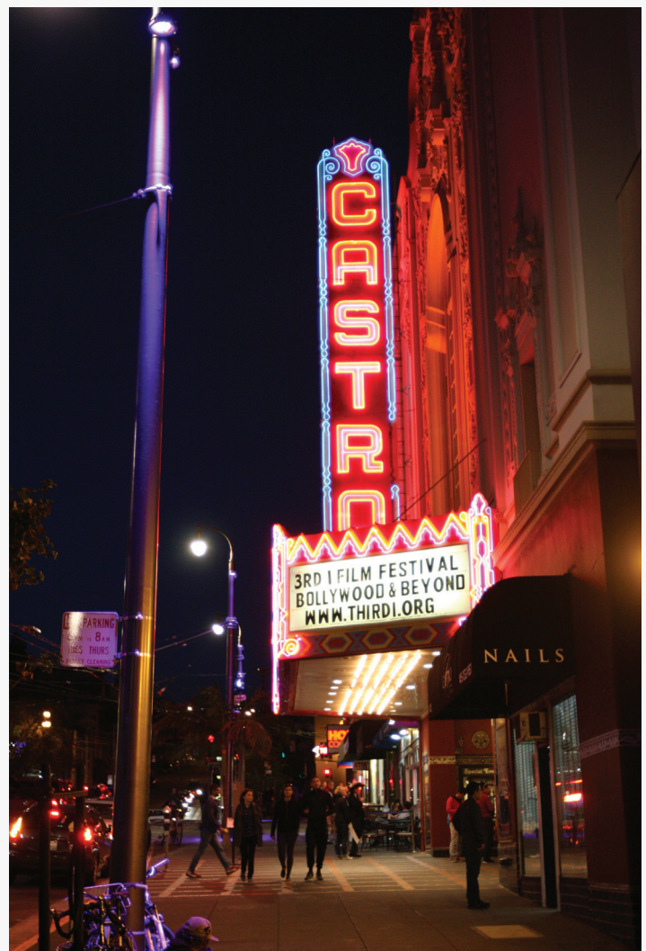
Castro Theatre marquee announces the 3rd i San Francisco International South Asian Film Festival, 2015.

375 27th Street, #A San Francisco, CA 94131 415.420.1630 www.sftff.org