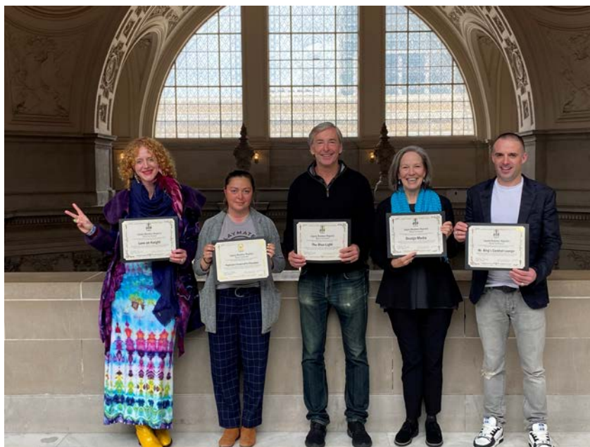
Representatives of businesses added to the Legacy Business Registry, March 13, 2023

Businesses that wish to be included on the Legacy Business Registry must be nominated by the mayor or a member of the Board of Supervisors and complete an application, including an application form and written historical narrative. Nominations for the Registry are made on an ongoing basis and are limited to a total of 300 businesses per fiscal year (July 1 through June 30). Completed applications are reviewed by the Historic Preservation Commission, which makes a recommendation, followed by the Small Business Commission, which makes the final determination. For more information on how to apply for the Legacy Business Registry, visit www.sf.gov/legacybusiness and click the link “ Apply to join the Legacy Business Registry .”