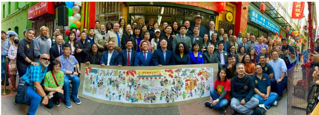
Golden Gate Fortune Cookies' 60th Anniversary, August 2022