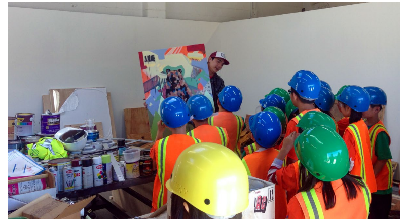
Artist speaking to school tour group