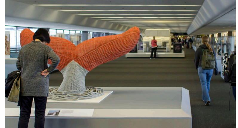
5 million travelers saw exhibition at SFO – United Terminal