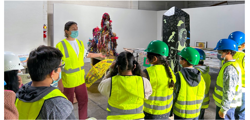
Staff speaking to school tour group in art studio