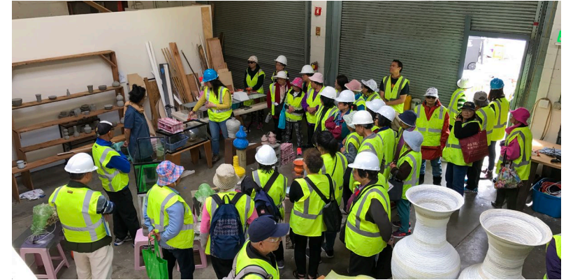
Artist speaking to adult tour group