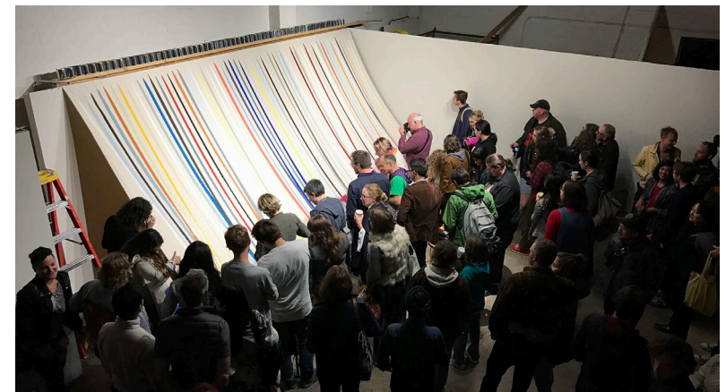
Three-day art opening and artist talk attended by over 500 visitors