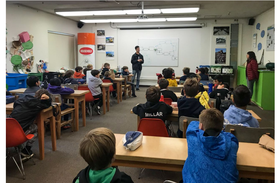
Classroom presentation with 3rd grade students in the ELC