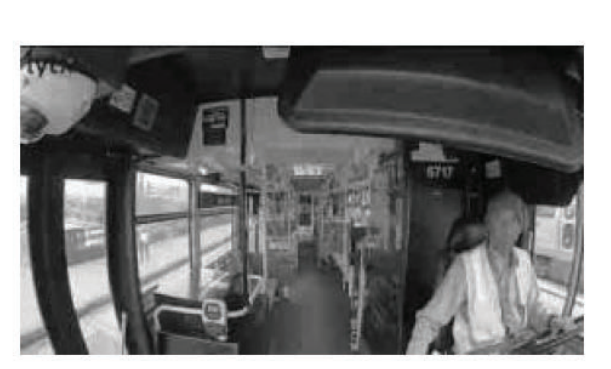
Sep 1, 2022, 7:36:39 AM PST