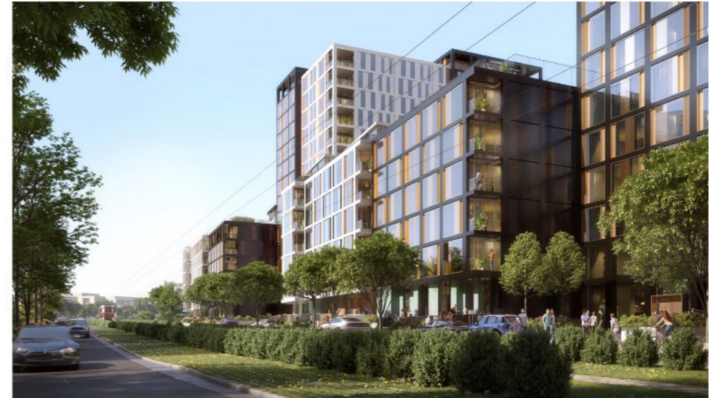
Parkmerced Block 21S view along Font Boulevard, rendering by Kohn Pedersen Fox