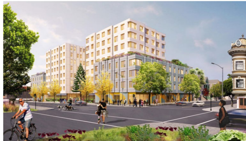
730 Stanyan Street northeast corner, rendering by OMA