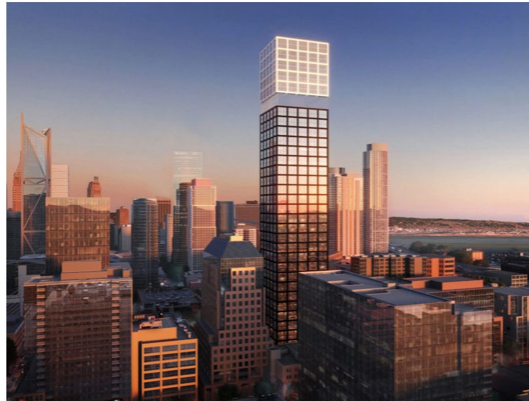
620 Folsom Street sunset aerial view, rendering by Arquitectonica