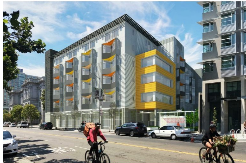
1064-1068 Mission Street, design by Herman Coliver Locus Architecture