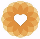
Outcome of Facility Reported Incidents (FRIs)