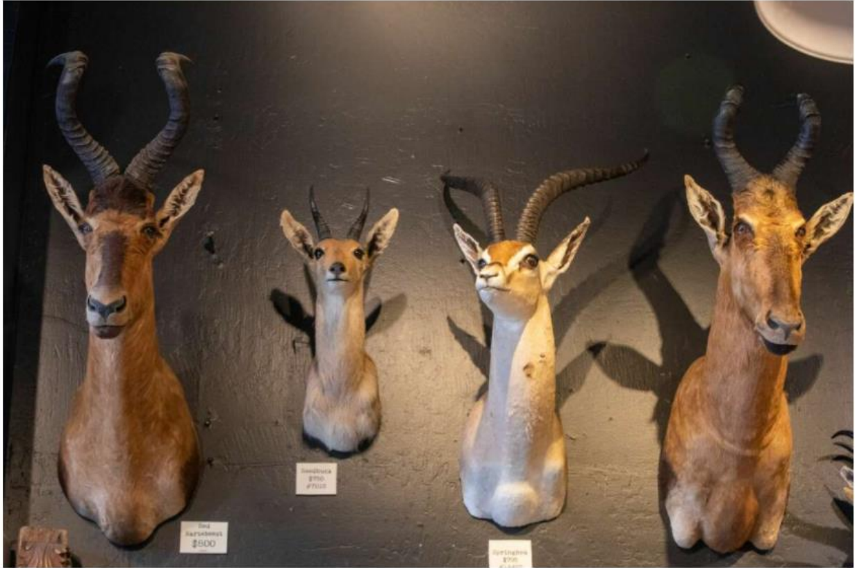
Some of the taxidermy and oddities inside Paxton Gate, a shop in the Mission District of San Francisco, Calif. on Oct. 20, 2021.

Then, in 1999, after Paxton Gate moved to its current, larger space on Valencia Street, fate intervened.