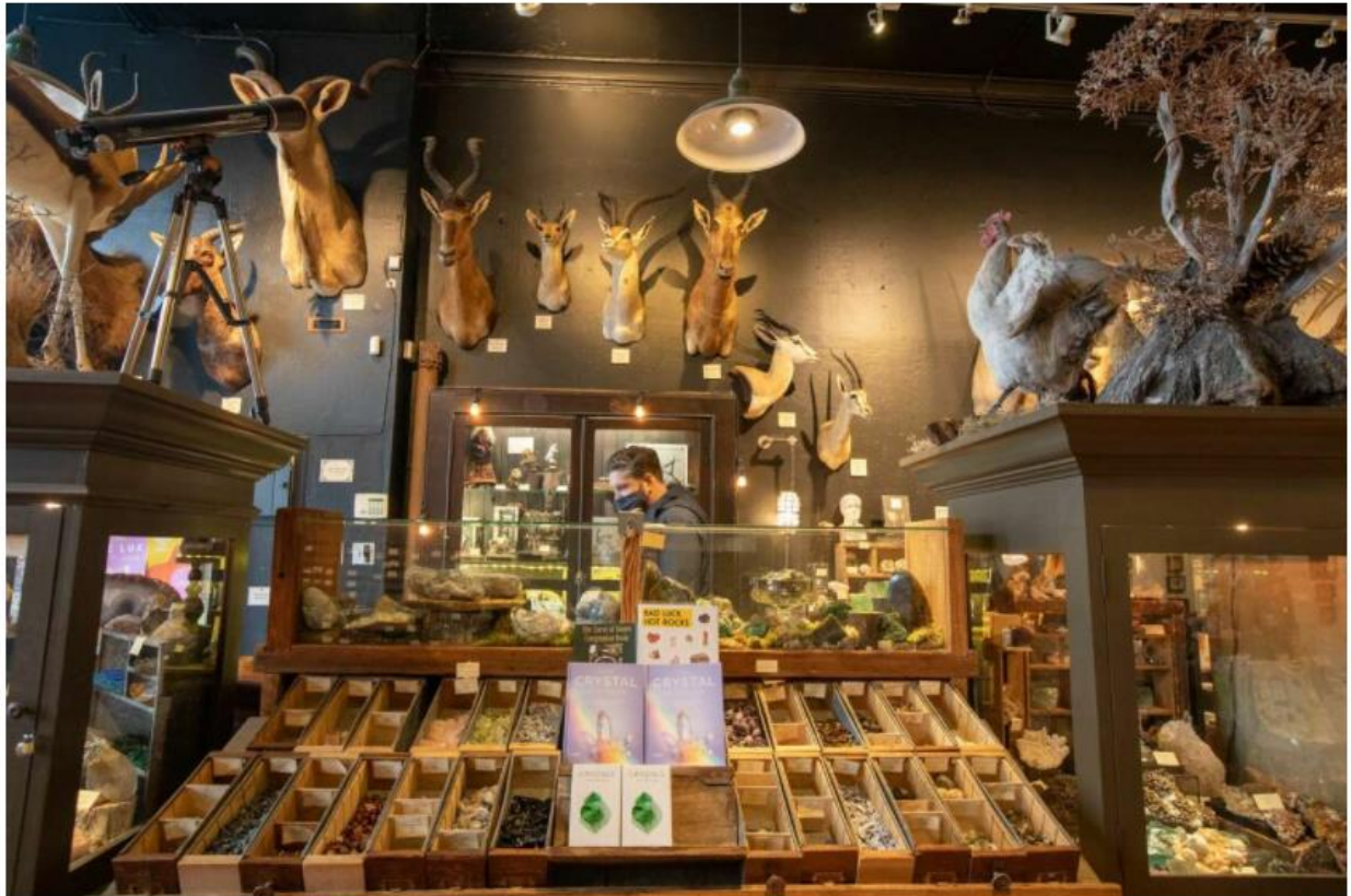
A customer browses through some of the taxidermy and oddities inside Paxton Gate, a shop in the Mission District of San Francisco, Calif. on Oct. 20, 2021.

In the time since that fateful encounter with the game hunter, Paxton Gate has played host to dozens of strange, and often rare creatures.