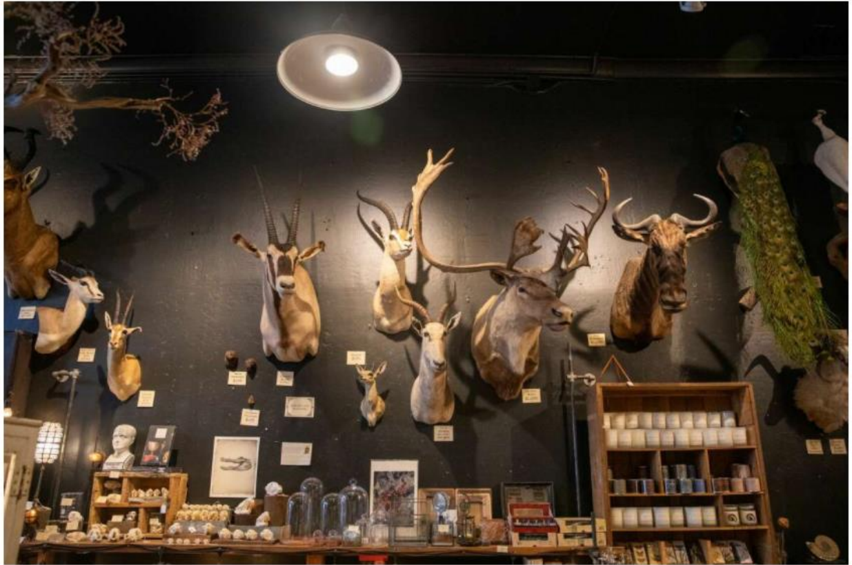
Some of the taxidermy and oddities inside Paxton Gate, a shop in the Mission District of San Francisco, Calif. on Oct. 20, 2021.