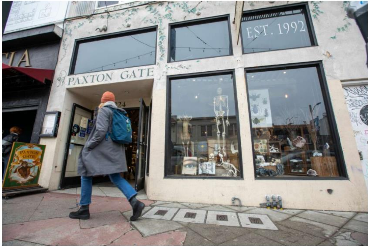
— A pedestrian walks by Paxton Gate, a taxidermy and oddities shop in the Mission District of San Francisco, Calif. on Oct. 20, 2021.