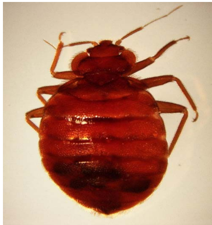
Adult Bed Bug