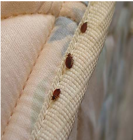
Bed Bugs Nesting in a Mattress