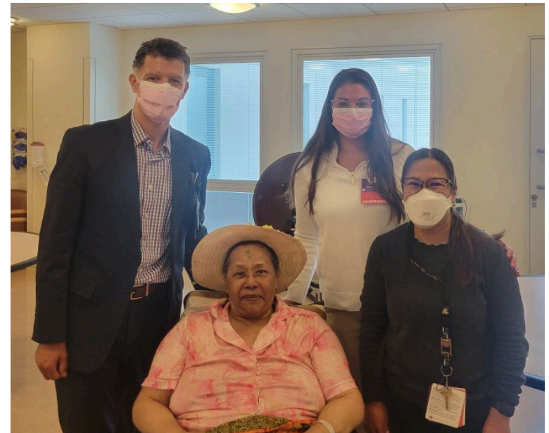
Welcoming back a former resident who was transferred when there was a threat of closure.