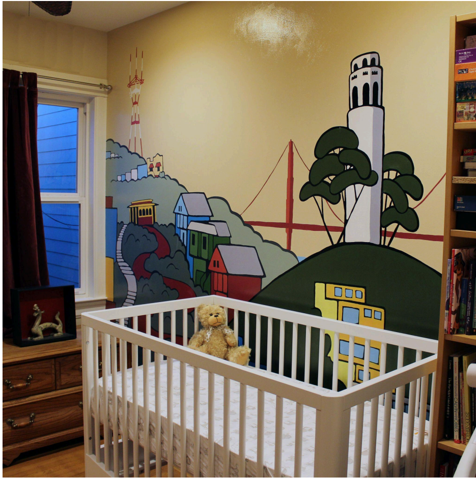
Nathaniel J. Bice SF Icons Nursery Mural, 2024 Private Home 8'x10'