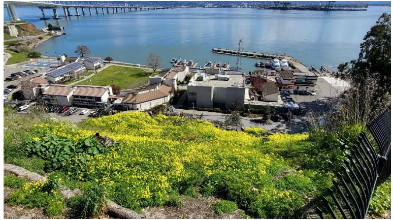
Yellow oxalis infesting the hillside above the Coast Guard base.