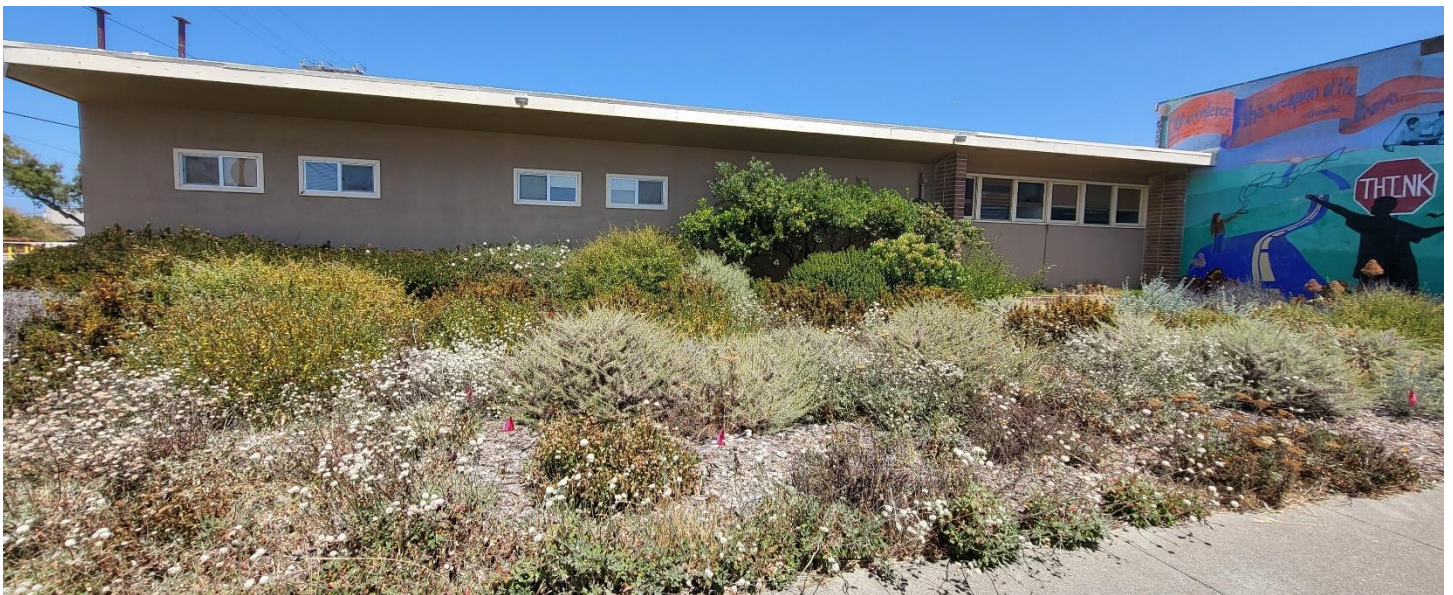
Native plant demonstration garden - year 4 - at Life Learning Academy.

TIDA, Rubicon, and SFE have installed over a dozen local native plant demonstration gardens across the two islands. These gardens showcase plant species that are native to Yerba Buena Island (and San Francisco) to show how successful they can be in the built environment, given appropriate levels of maintenance, as with any garden. The gardens in front of the Life Learning Academy, next to the YMCA gym, next to the shed at the corner of Northgate Road and Whiting Way, and, increasingly, in front of Quarters 1, are particularly impressive in their maturity, diversity, and success.