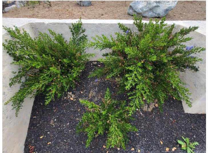
Ceanothus planted in alcove along path to Panorama Park plaza.

Proposed Solution: Thin out this winter and transplant most plants to other locations. Determine if desired to retain one individual in each alcove or switch to smaller stature species, e.g., sticky monkey flower.