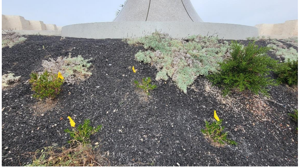
Black-colored mulch at Panorama Park.

Proposed Solution: Replace with more natural mulch and/or allow the natural process of leaves dropping and blowing in to cover it over.