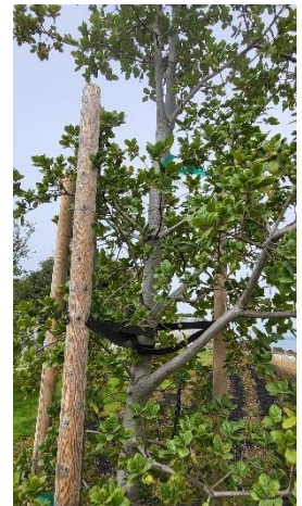
Coast live oak with rubber strapping.

In-Progress Solution: Remove all of the constraining straps on all of the new trees. Consider any potential exceptions on a case-by-case basis.