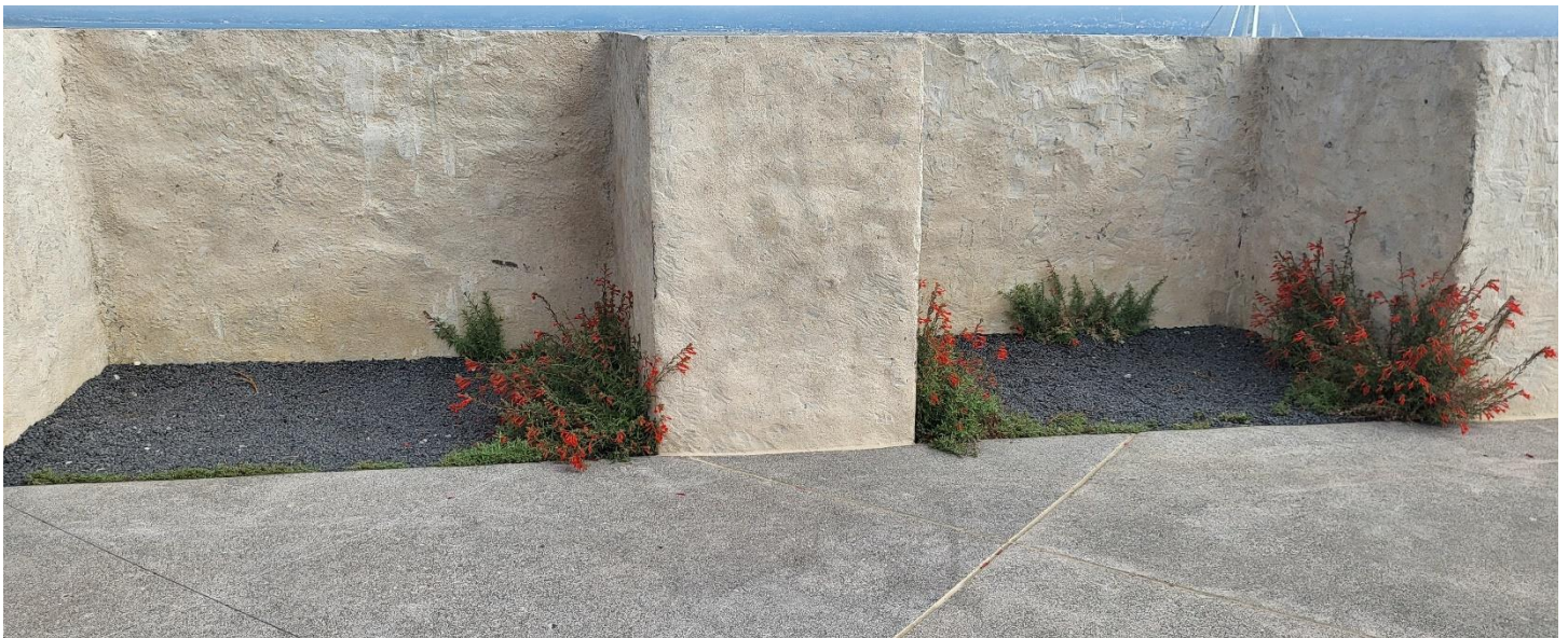
California fuchsia planted in "viewing alcoves" at Panorama Park.

Proposed Solution: : Consider installing unobtrusive and hardy bunchgrasses (e.g., purple needle grass ) along the inside perimeter of the alcoves or just do nothing and let the natural pattern of traffic determine what survives, while paying attention to any invasive weeds that might take advantage.