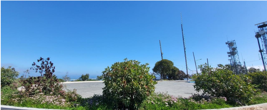
Madrone trees planted around Signal Point, including one of poor quality.

Proposed Solution: Trim dead branches from the one poor individual and determine tolerance level for severely pruned, yet still alive individual; continue to monitor other individuals for stress; monitor trees for height, spacing and potential stress from soil volume constraint.