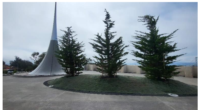
Monterey cypress at Panorama Park.

Proposed Solution: Remove and replace with dark colored native shrubs, e.g., California coffeeberry or blue blossom ceanothus, if the desire is to maintain species with dark foliage in that location.