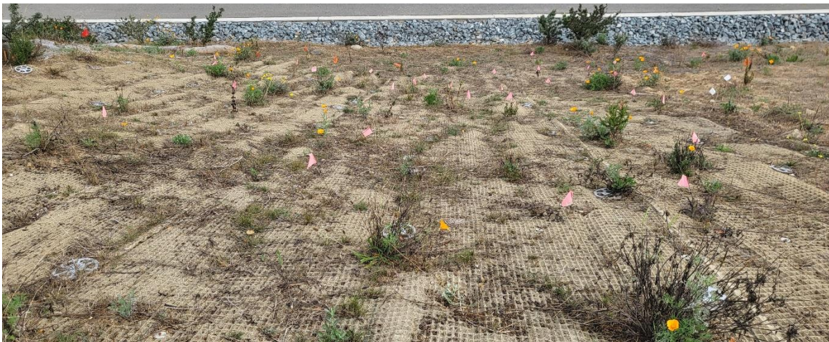
Enhancement native shrub planting showing small plants and flags.

In-Progress Solution: Continue monitoring slopes as rainy season unfolds; manage invasive weeds; and determine if any additional plantings will be necessary/desired.