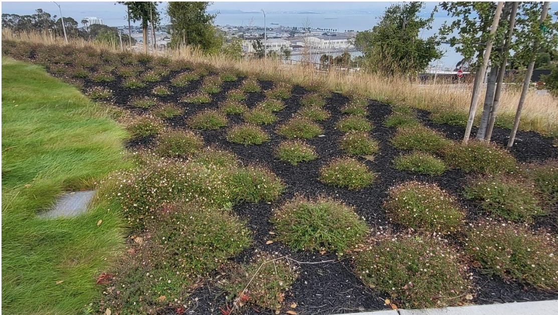
Mexican daisy planted in saddle between two hilltops.

In-Progress Solution: Continue monitoring for behavior at saddle between two hilltops and consider replacing with seaside daisy, Erigeron glaucus .