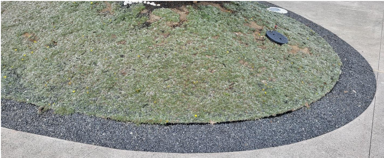
Small gauge gravel sitting at grade at Panorama Park plaza.

Proposed Solution: (for Panorama) Install a 4-inch flashing or replace gravel with larger diameter rocks or change to decomposed granite or install permeable paving.