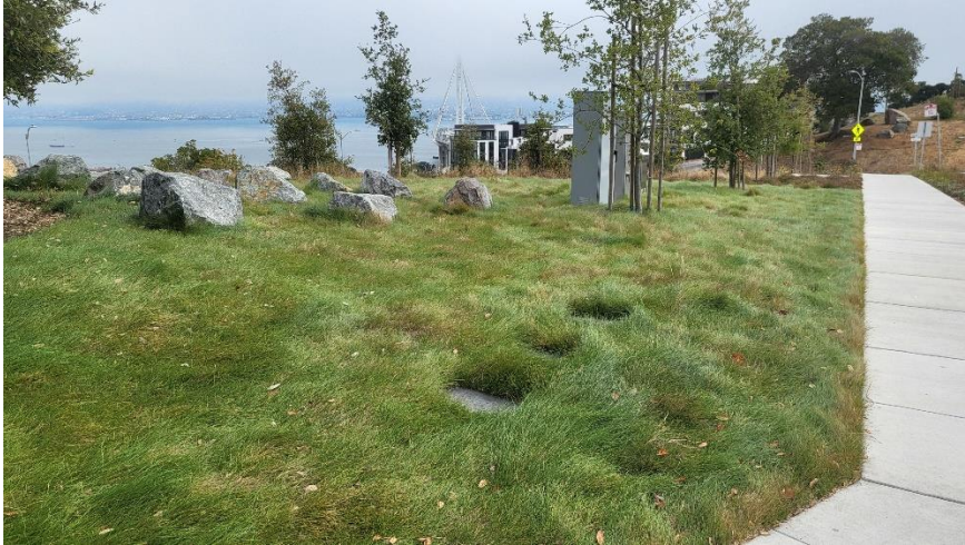
“No Mow” fescue grass planted in saddle between the hilltops.

In-Progress Solution: Experiment with dialing back the quantity of water to determine minimum water needed to maintain vigor and green in the dry season.