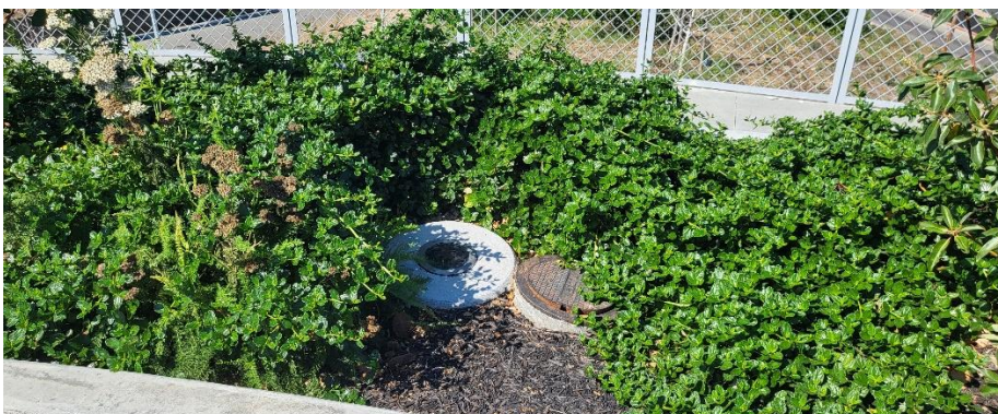
Carmel creeper planted in narrow beds around Signal Point.

Proposed Solution: Consider replacing with smaller perennials such as seaside daisy, coast buckwheat, California fuchsia, or California phacelia, to complement the yarrow that is already prolific in the Signal Point planting bed.