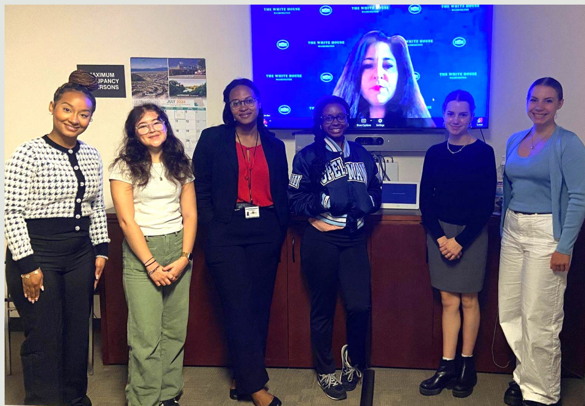
White House Briefing