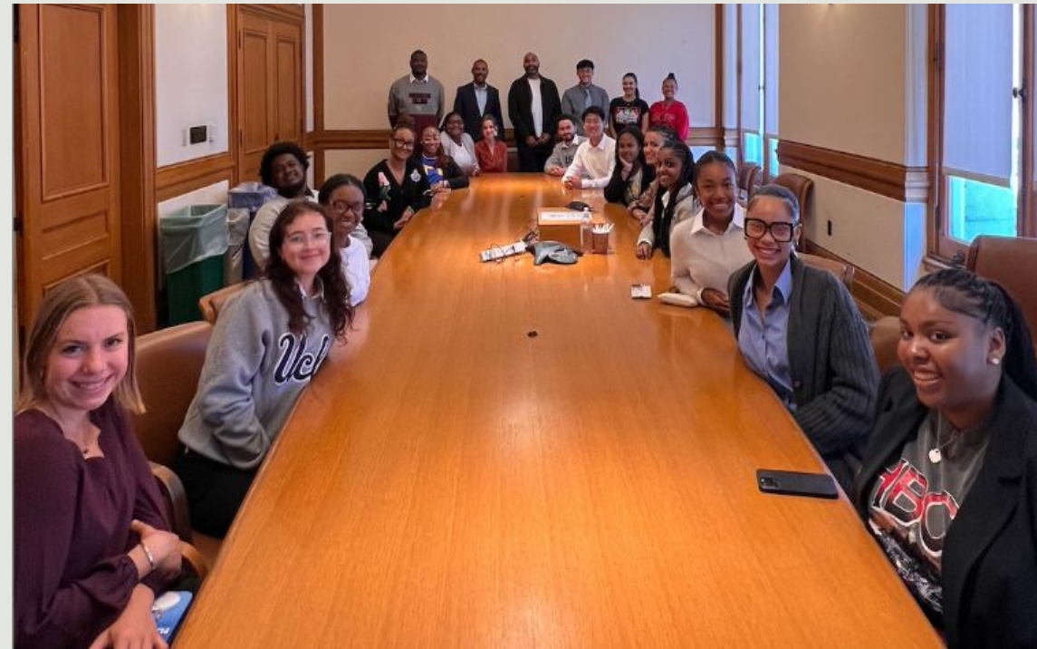
Met Commissioner Shamann Walton, District 10