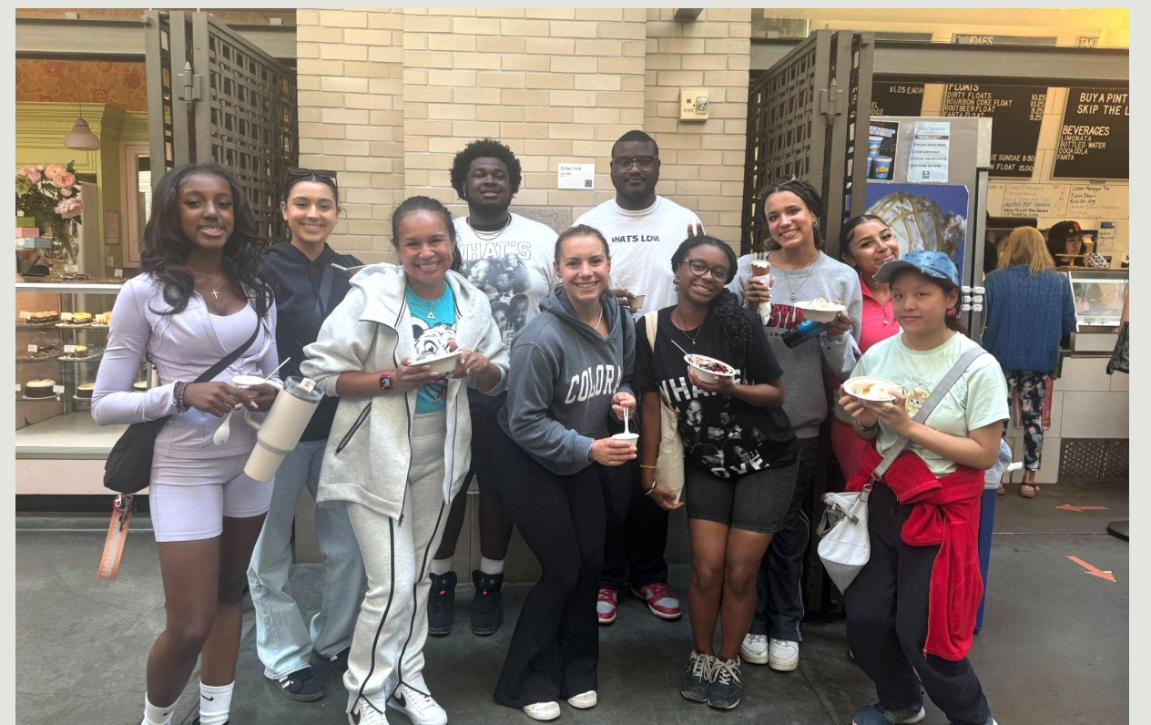
Field Trip of Historic Angel Island