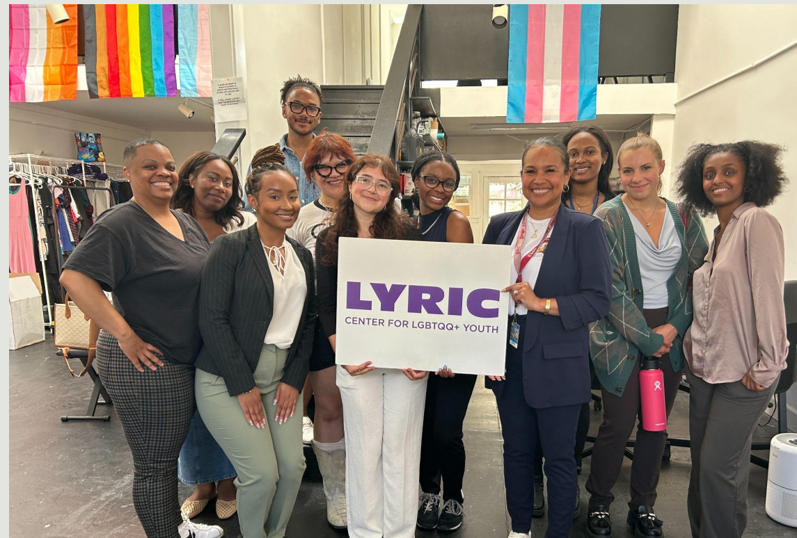
KYR LYRIC Presentation