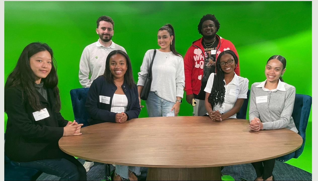
Tour of KQED Headquarters