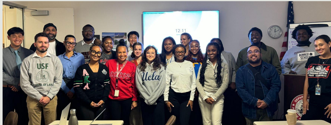
LinkedIn Workshop with PUC