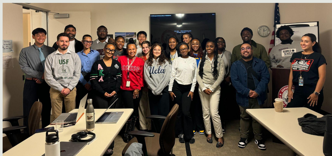
Resume Workshop with PUC