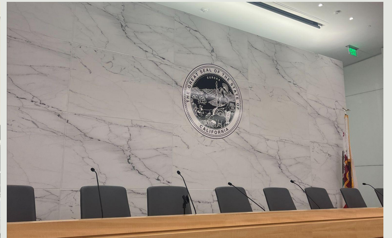
UC Law SF Tour & Presentation