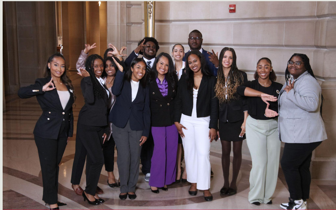
DPA HBCU & Divine 9 Students