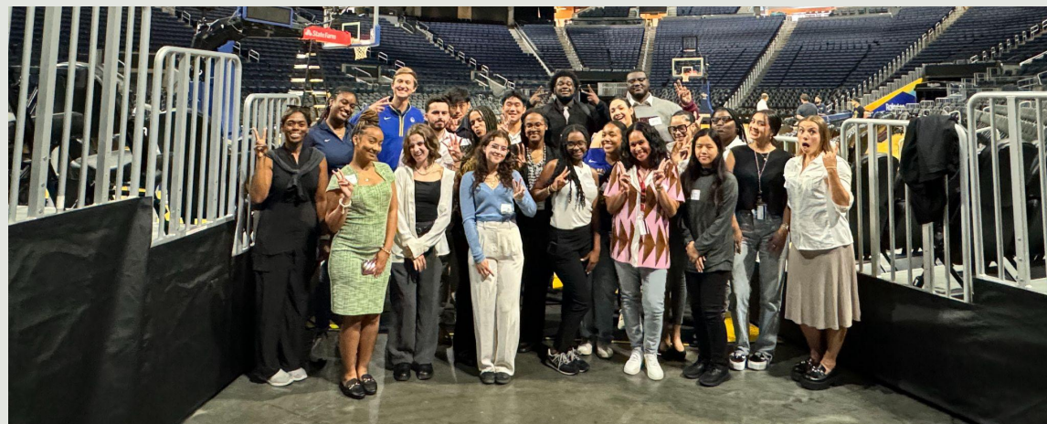
Chase Center Stadium Tour