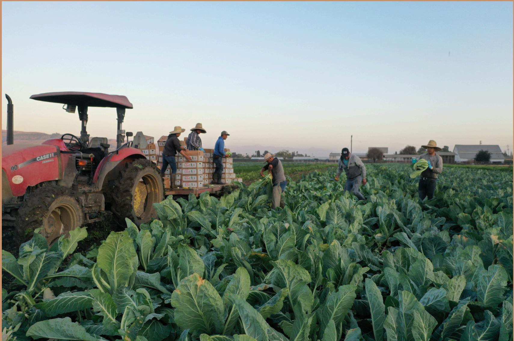
Rodriguez Brothers Ranch in Watsonville, CA