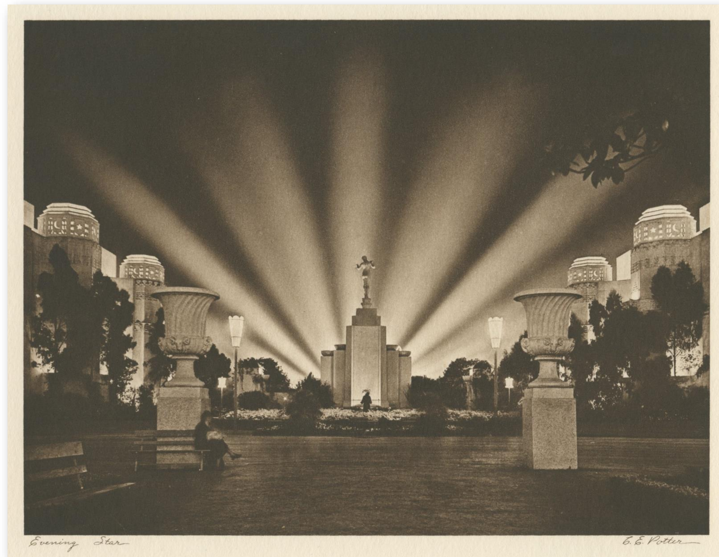
Golden Gate International Exposition architects and artists were tasked with creating a world of pure imagination on Treasure Island in 1939. The fairgrounds featured pavilions, statues, fountains, murals, and dramatic lighting. Our collection includes images by both amateur and professional photographers that recall this bygone era.