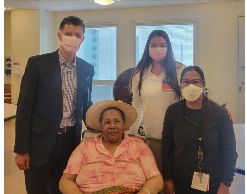
Welcoming back a former resident who was transferred when there was a threat of closure.