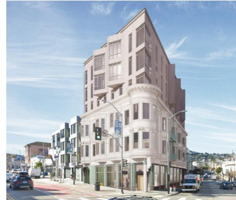
3300 Mission Street establishing view, rendering by BAR Architects