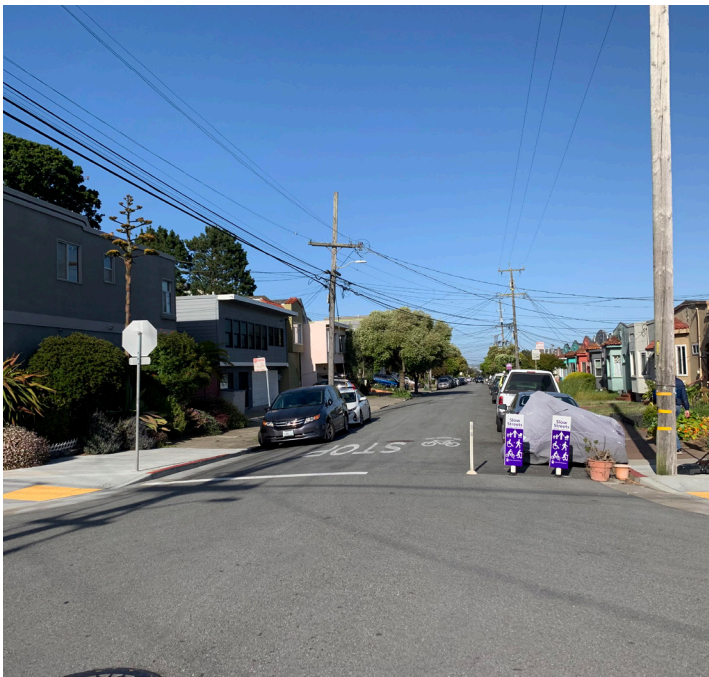
Hearst East Facing