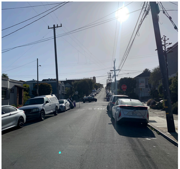
Hearst West Facing