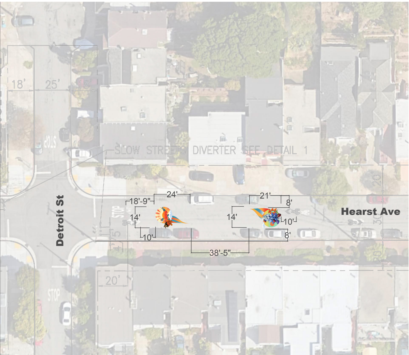
Approximate dimensions and size of mural. The dimensions are based on the aerial photo.