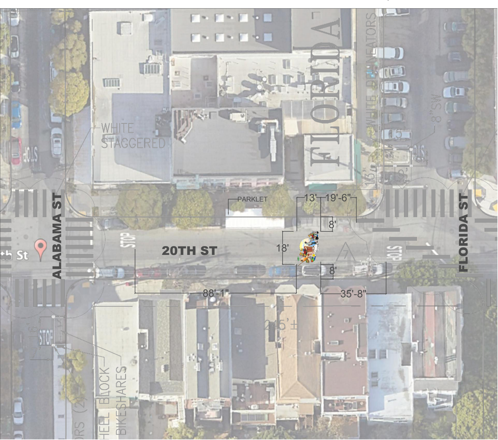
Approximate dimensions and size of mural