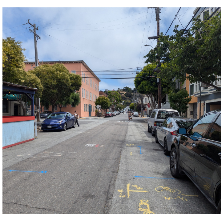
20th St looking towards Florida St