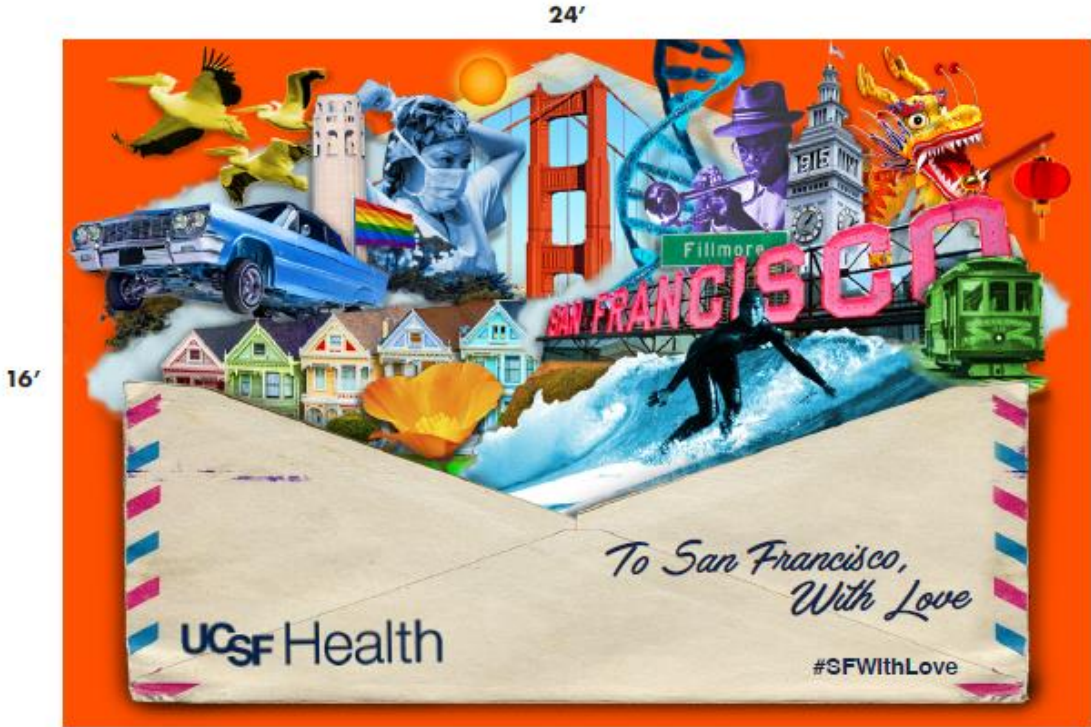
UCSF MURALS CONCEPT FINAL