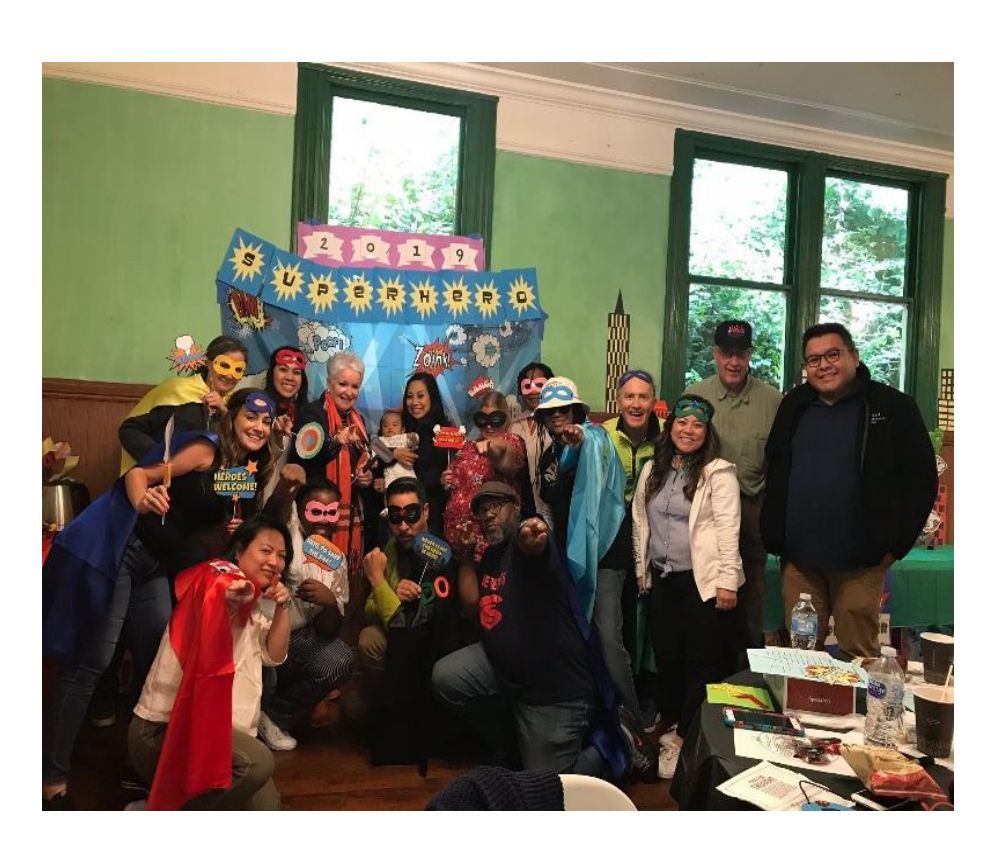
SPY Superhero Themed Staff Retreat, 2019