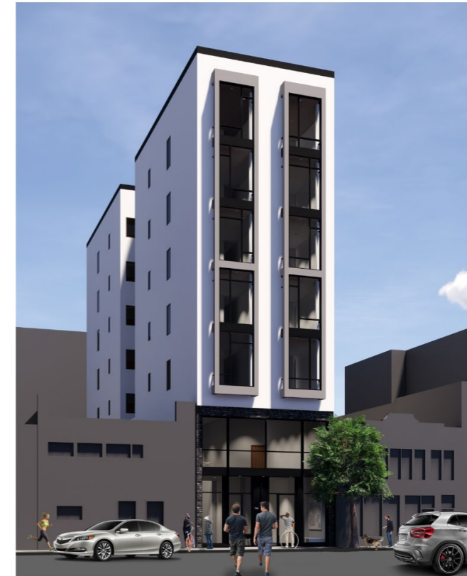
159 Fell Street facade elevation, rendering by Winder Gibson Architects