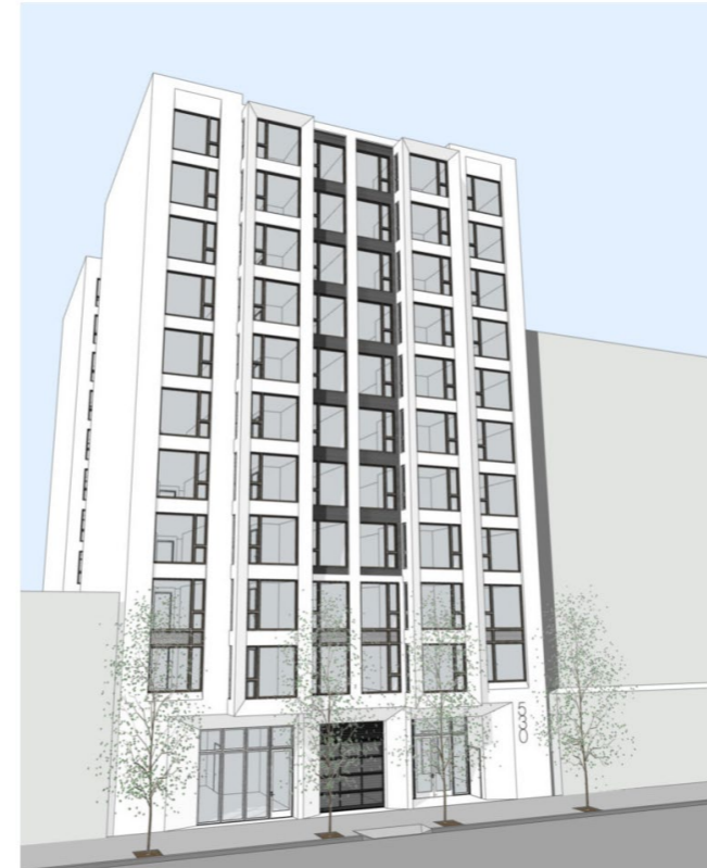
530 Turk Street, illustration by RG Architecture