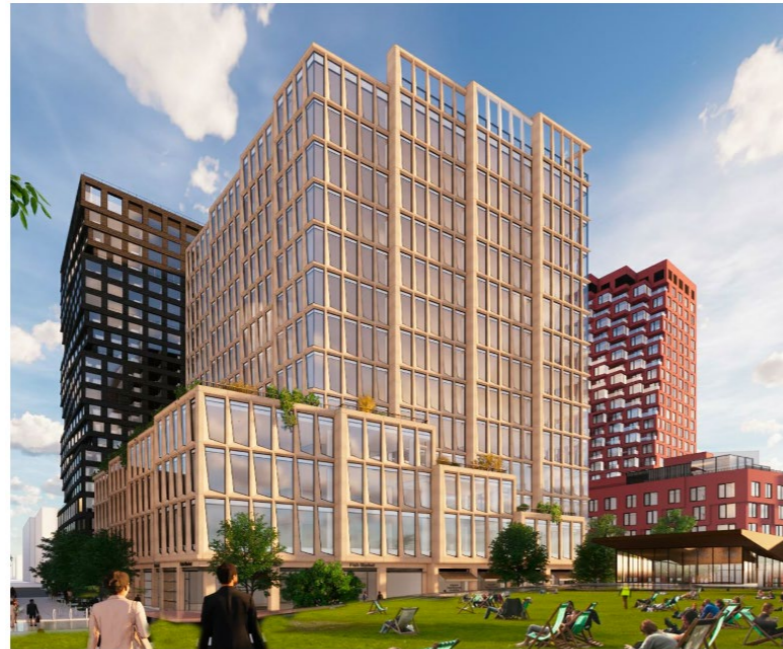
Mission Rock Block G northeast view, design by Henning Larsen Architects