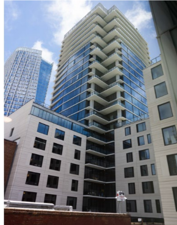
View of Chorus from 53 Colton Street studio unit